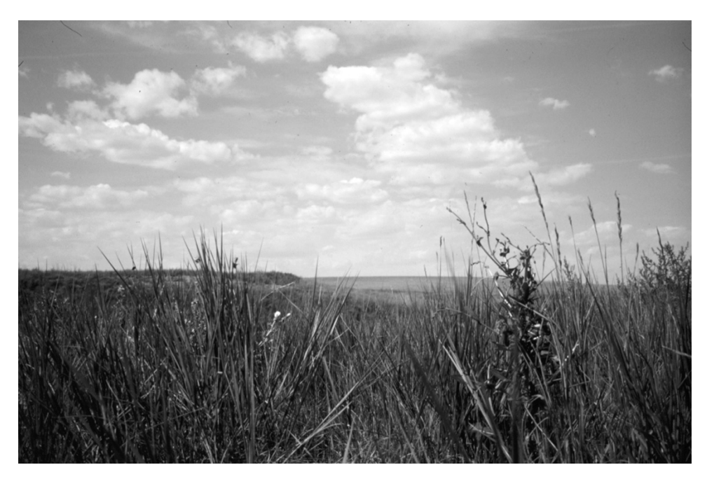
Grain was harvested from the study area during summer 2004. The USGS has samples of this grain for later analysis.