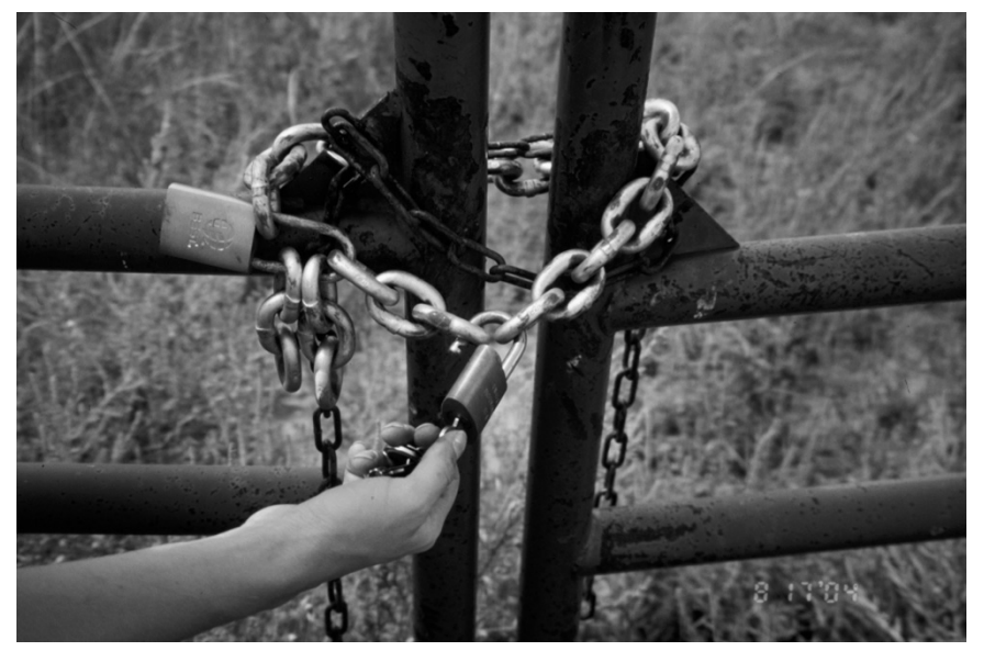
Access to the Metro District property and other property in the study area is restricted. The USGS contacts the appropriate land owner (including the Metro District) before any visit to that property.