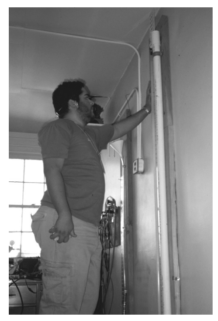
The USGS has an apparatus to test pressure transducers at the Denver Federal Center. This apparatus will be used to test the equipment removed from D25.

Biosolids samples were collected each month. Each sample was a 24-hour composite from the conveyor belt at the Metro District facility. The material was placed in two acid-washed, one-gallon plastic or glass bottles and transported to the USGS in Denver. There, the samples were air-dried then ground to less than 150 micrometers. Chemical analyses were completed and compiled for all biosolids samples collected from August 2003 through January 2004. Reviewed draft reports were revised. The remaining reports were written.