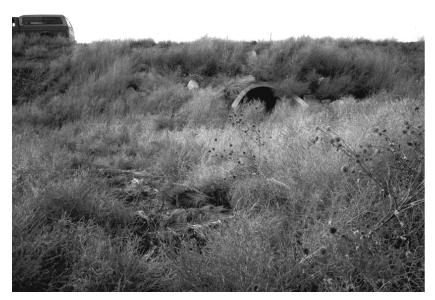
Water levels in wells DTX1 and DTX3 have declined since 1999. The USGS looked at culverts (shown above), road improvements, and drainage-basin features in the vicinity of wells DTX1 and DTX3 to see if surficial changes, such as ponding or deposition, could be causing the water-level declines.