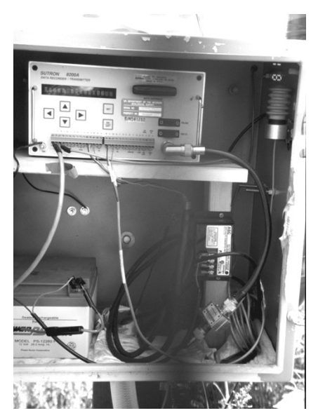
The continuous-recorder data for D25 have not been available on the Internet because one of the instruments stopped working. That instrument has been removed and brought to Denver for repair.

Ground-water levels will be measured at least every other month. Ground water at selected sites will be sampled the first month of each quarter, weather permitting. Data will be compiled and reviewed. The annual reports for 2001 and 2002-03 will be approved, printed, and distributed. The interpretive report for 1999-2003 will be reviewed, revised, approved, and printed. A presentation about findings from this program for 1999-2003 will be made to stakeholders (scheduled for October 12, 2004). The USGS will discuss ideas for future monitoring with stakeholders.