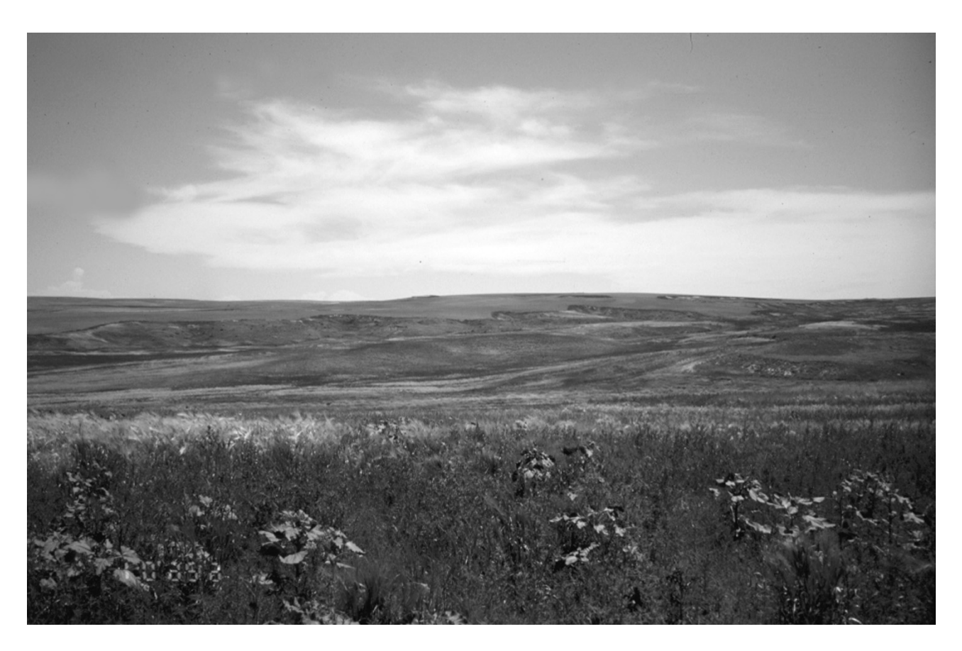
The streambed-sediment sampling basin near DTX2 on the Metro District property.

A: Rainfall runoff was not sufficient to collect streambed-sediment samples during January through July 2004. Soil from the monitoring fields (shown on page 2) was not sampled during January through July 2004. Crop samples from the summer 2004 harvest on the Metro District property were collected, but not yet analyzed.