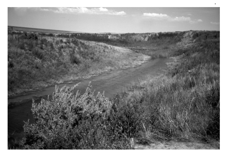
Beaver Creek near well DTX6 occasionally flows for at least a day after rain. This is the best location in the study area if we were to obtain a water-quality sample from a stream draining a biosolids-applied site.