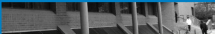
3: Greater Midwest Region: University of Illinois at Chicago