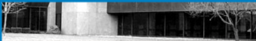
8: New England Region: University of Massachusetts