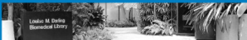
7: Pacific Southwest Region: University of California, Los Angeles