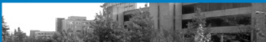
6: Pacific Northwest Region: University of Washington