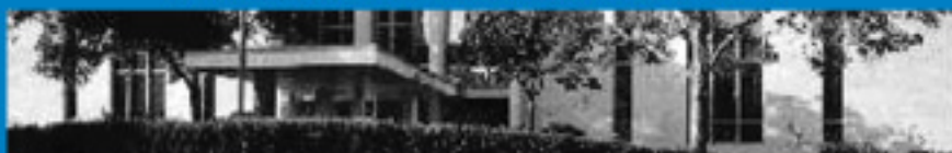
5: South Central Region: Houston Academy of Medicine