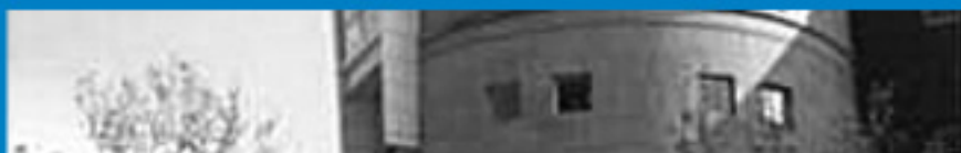
2: Southeastern/Atlantic Region: University of Maryland at Baltimore