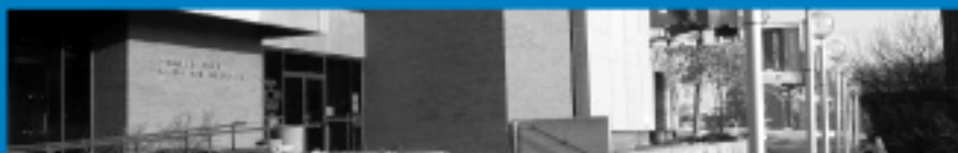
4: Midcontinental Region: University of Utah