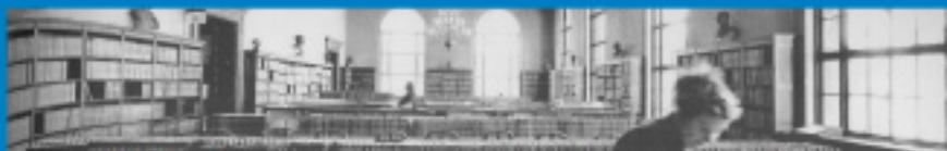
1: Middle Atlantic Region: New York Academy of Medicine