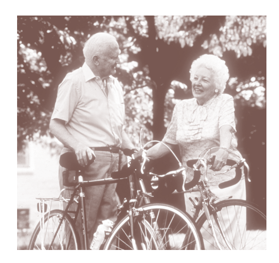
understanding of molecular processes affecting human health and disease. (see Goal 4)

NLM should continue its commitment to organize genomic data to meet the rapidly evolving genome research agenda. The explosive growth in the fields of genetics and molecular biology, spurred largely by the worldwide success of the Human Genome Project, has resulted in staggering volumes of data that have increased by many orders of magnitude over the past decade. Looking beyond the sequencing and mapping achievements of the Human Genome Project, the research focus turns to analysis of the whole genome and application of this knowledge to medical practice. NLM should continue to play a key role in developing the genomics resources needed for comprehensive analysis of the human genome. The challenge for the next decade will be to keep pace with the flood of genome data, while also designing the tools and databases for the gene discoveries of the 21st century-discoveries that will advance