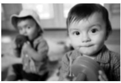
annual profile 2003