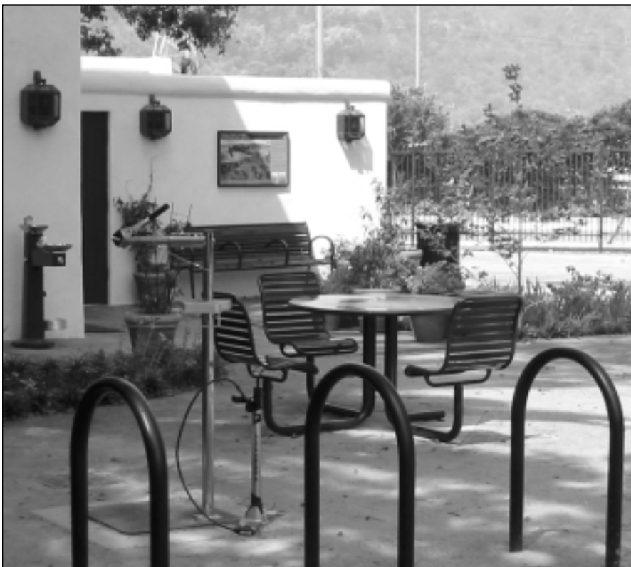
The Los Angeles River Gardens Center has recently installed an Anza Trail exhibit adjacent to a bicycle repair station. A picnic table, bike repair stand, and air pump await passing bicyclist who stop to ponder the Anza expedition along the Los Angeles River.

Whether you have a horse or not, all those interested in helping out on the trail are invited to come, rain or shine. The highlight of the event will be a trailside dinner and barbeque followed by a campfire talk.