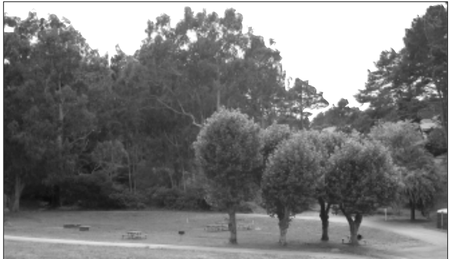
El Polín Springs was the primary source of water for both the indigenous inhabitants of San Francisco and the members of the Anza expedition.

Its archaeological remains were first discovered in 1993, and since then the National Park Service, the Presidio Trust, and the Army Corps of Engineers have led an active research program to better understand the history and culture of this important settlement.