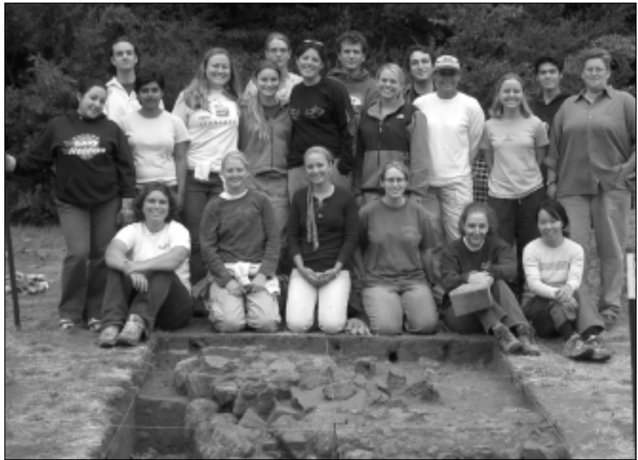
Students from Stanford University and UC Berkeley worked this summer on the excavating what is believed to be the foundation of the Briones home near Polín Springs in the San Francisco Presidio.

The Briones family's residence at El Polín Springs marked the beginning of civil settlement in colonial San Francisco. Living between the presidio and the mission, the Briones family was affiliated with both but under the direct control of neither.