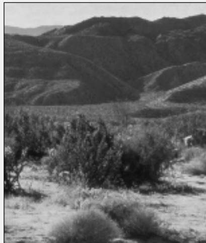
Anza Borrego Desert State Park

During the session, members will review the recently completed long range interpretive plan, discuss ways to better market the Anza Trail, and look for additional