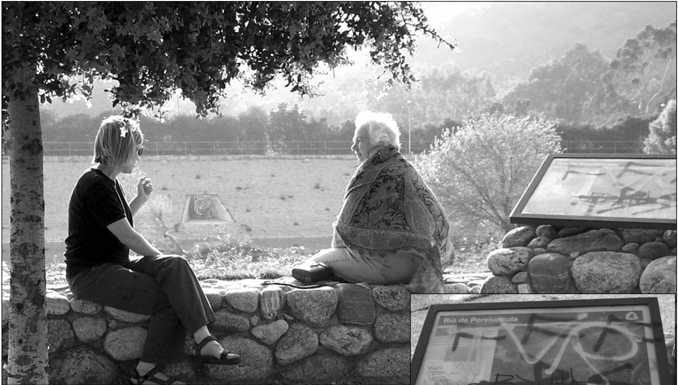
Hikers along the Los Angeles River on the Anza Trail relax and take in the view at one of the Northeast Trees parkettes. The Anza trail way-side (blow up at right) has been so heavily tagged by various gangs that it is currently unreadable.