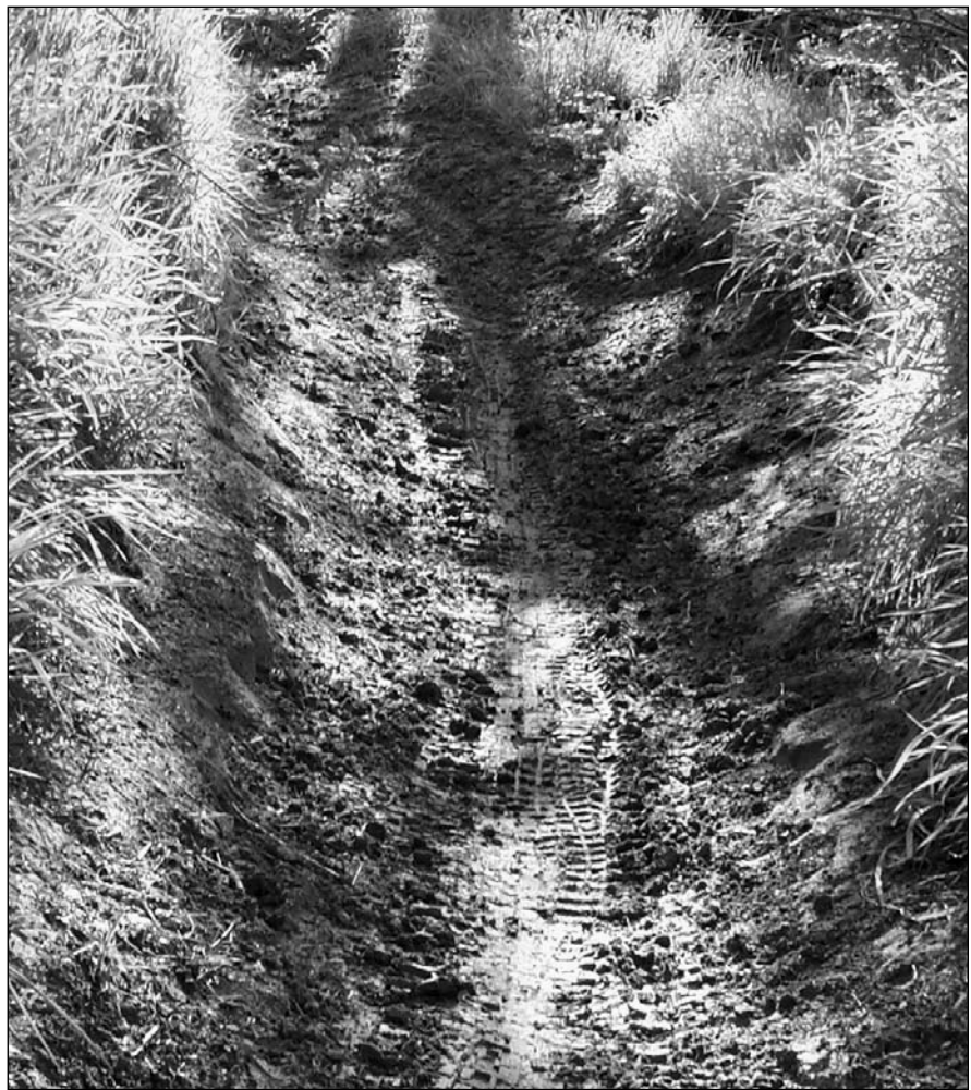
Motorcyclists have helped establish channels along the trail route in Atascadero, California. Off-road vehicles have caused soil compaction and destruction of the hiking and equestrian routes along the Salinas River.

These incidents in Los Angeles and Atascadero emphasize the challenges of administering a 1,200-mile national trail. They force trail administrators to rethink the best way of managing the Anza Trail. Having seen the effects of graffiti on the Los