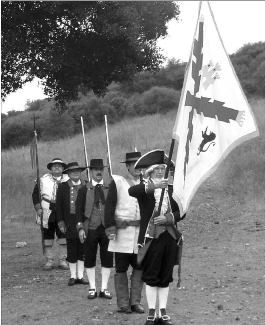
Soldiers from the Santa Barbara Presidio presented colors and arms at Santa Monica Mountain National Recreation this March. They were there to commemorate the Anza Trail and the park's 25th anniversary.

coursework, they will be using primary and secondary sources to analyze a variety of issues, ranging from the impacts settlers had on the overall landscape of the Bay Area to the type of social and moral codes of the early Spanish settlers and indigenous communities. At the end of the semester, the research papers will be linked to the Anza Trail web site as complimentary resources to the archives on Web de Anza.