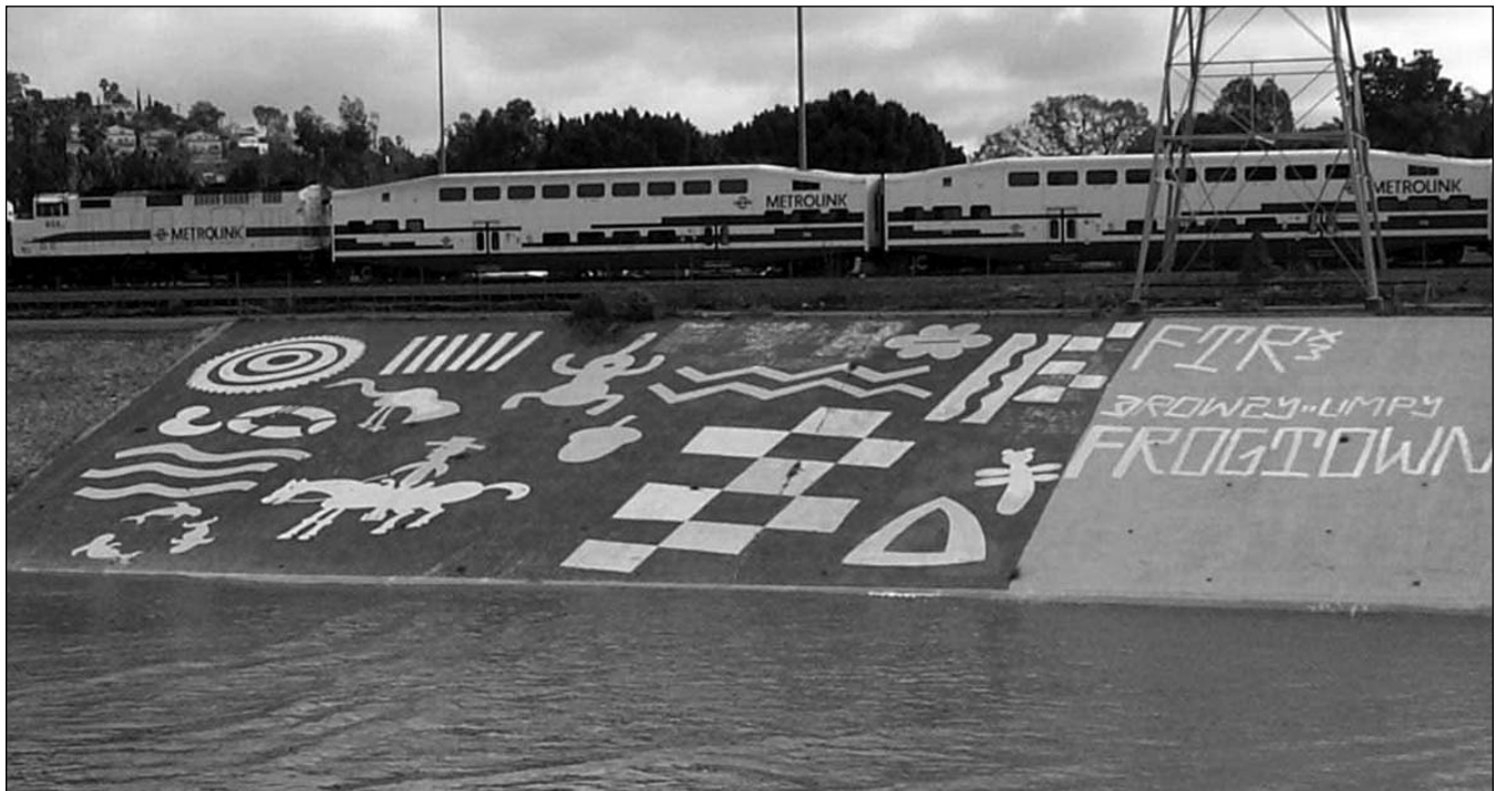
The Anza Mural is visible both from the Anza Trail and Interstate 5 along the Los Angeles River. Some recent gang tagging on and around the mural has been painted over but the site is still marred by graffiti.

A hike down this well-used portion of the Anza Trail between the mural and the interpretive wayside shows increasing incidents of tagging and graffiti. Specifically, vandals have attacked the various parkettes Northeast Trees created along the trail. Northeast Trees is working with the city's parks department and the Mountain Recreation and