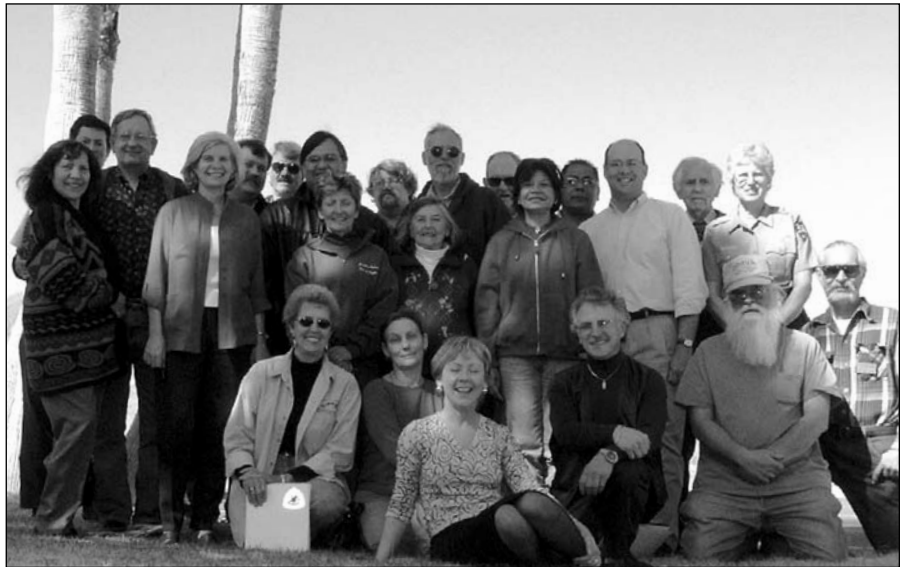
Anza Trail Advisory Council members were joined by concerned members of the public to discuss the future of the trail at their second meeting this February under sunny skies at Borrego Springs, California.

Although the trail was authorized by Congress to convene an advisory council back in 1994, it was not until last year that the Secretary of