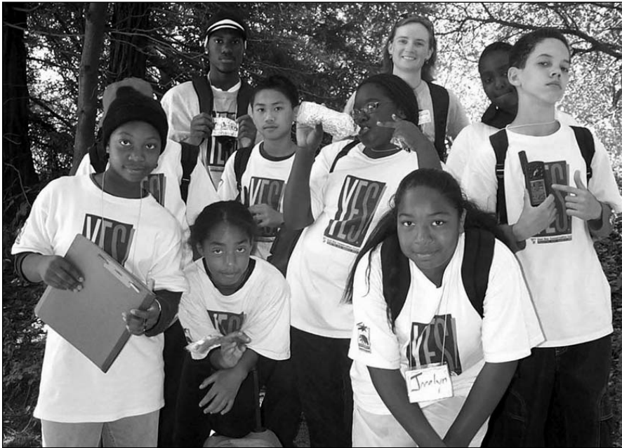
Students learn about Anza firsthand while hiking the trail in Oakland.