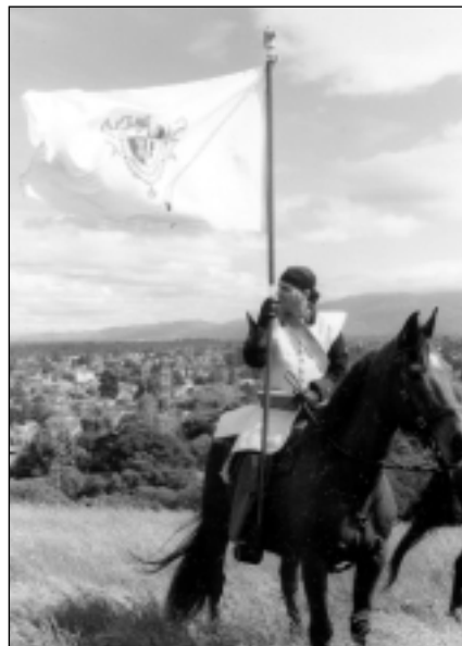
An Anza Lancer at Cupertino Knoll