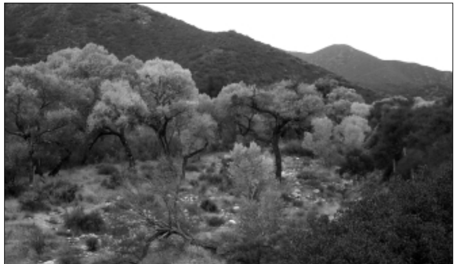
View from Bautista Canyon Road which follows the historic Anza route, connecting the desert community of Anza with the San Bernardino National Forest. It is slated to be paved.

A recent walk along the entire stretch of road with representatives of FHWA, the county, and the Forest Service revealed