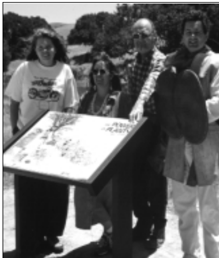
Over the past ten years, much of our interpretation has been directed toward the installation of waysides along the trail route, such as this one on Fort Ord Public Lands in California.

We can make these decisions, and many others about the direction our interpretation should take, through a process the National Park Service calls the Long Range Interpretive Plan (LRIP).