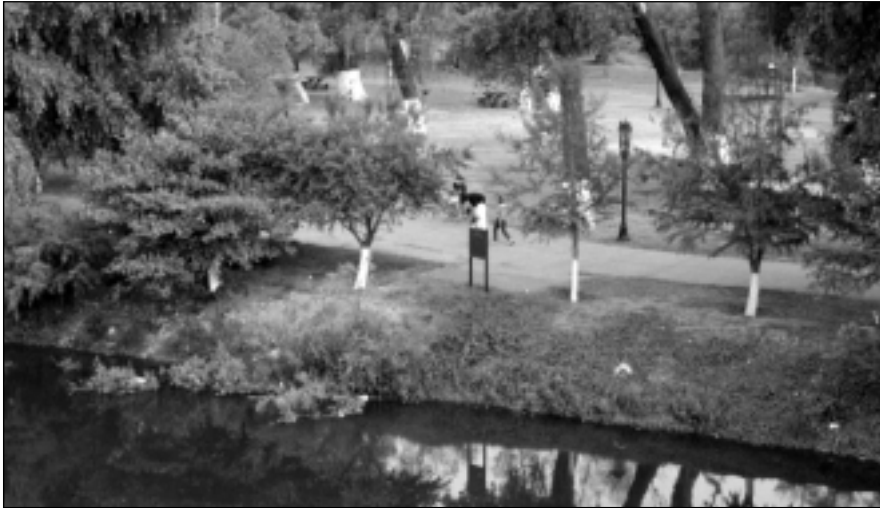
Tropical Trees provide abundant shade to pedestrians strolling along the green belt that runs through Culiacán - the same waterway used by the 1775 expedition.

Breezing down the roads to Mexicali, as the desert turned drier and drier, I knew the Anza expedition had to cross another 700 miles before they would arrive in Monterey. Since I was exhausted after only two weeks on the trail, I could fully appreciate the strength and courage of the members of the expedition. ♦