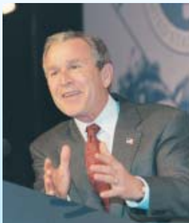
President George W. Bush

The President also noted the importance of personal retirement accounts in which workers could voluntarily invest part of their Social Security taxes directly in the market. "Someone retiring today after 45 years of work would be entitled to a monthly benefit of $1,128 from Social Security. If those Social Security taxes had been invested in the stock market during the same period of time, that person would now have . . . income of more than $3,700 a month," he said. Personal retirement accounts would give older Americans "access not just to a monthly check, but to personal wealth."