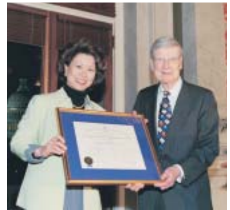
Secretary Chao honors Senator William Roth

At the Congressional breakfast on the second day of the Summit, Senators Arlen Specter and Tim Johnson joined Representatives Earl Pomeroy and Sam Johnson to offer a variety of perspectives on retirement savings.