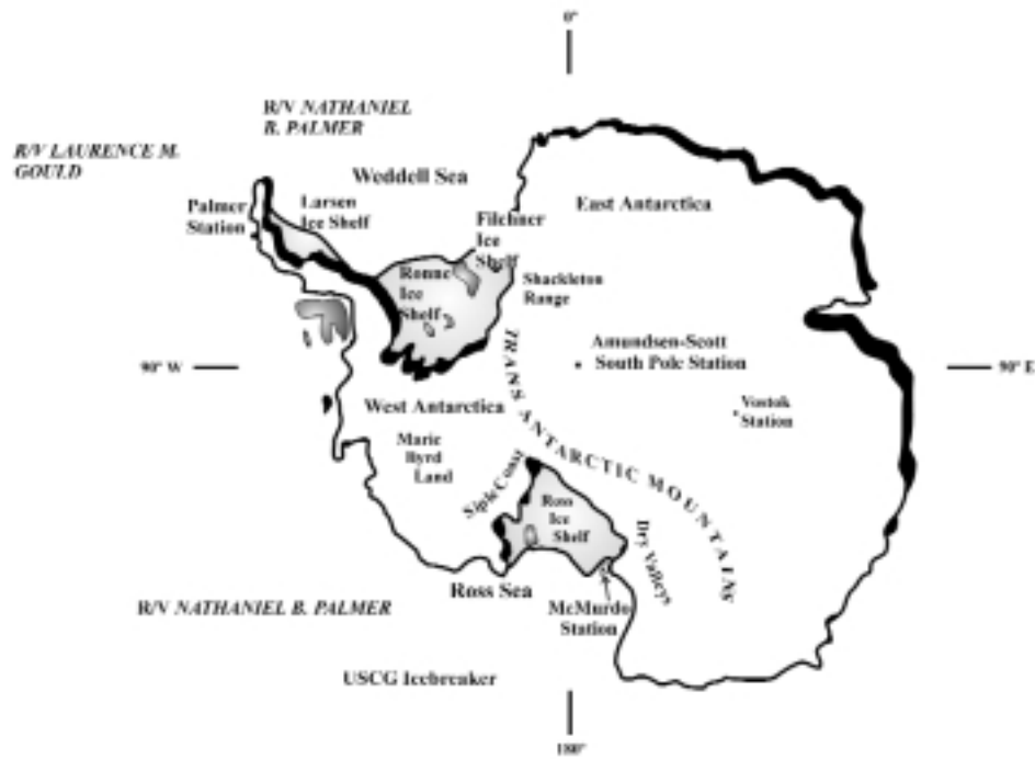
Number of projects to be supported during 1999-2000