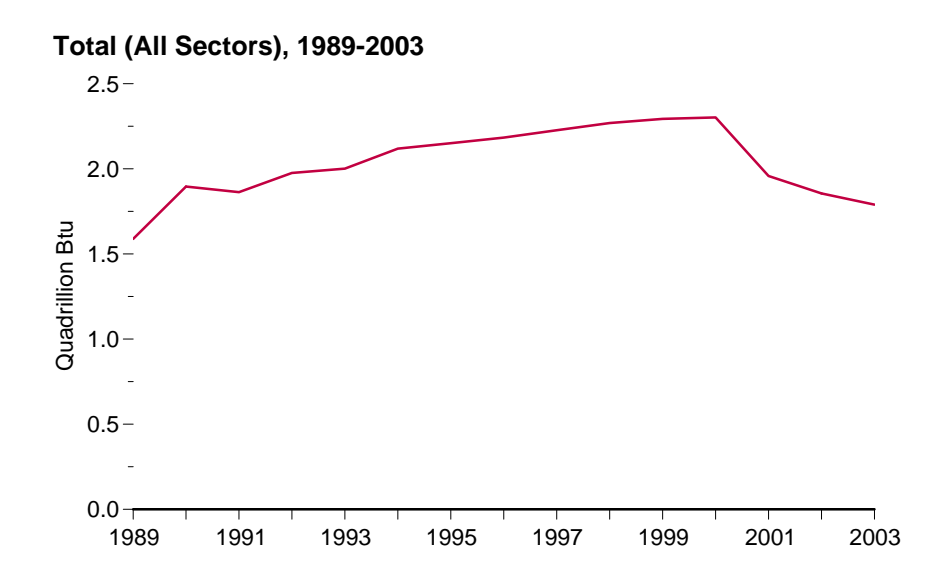
Figure 8.3 Useful Thermal Output at Combined-Heat-and-Power Plants