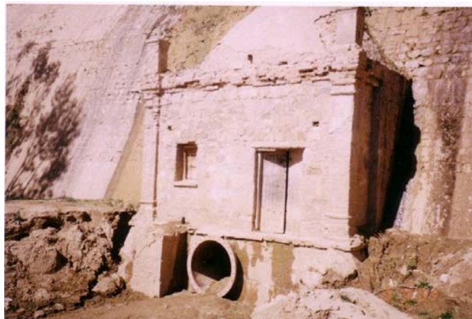
Zana Khan Dam gallery building will be repaired as part of a soon-to-be awarded contract.