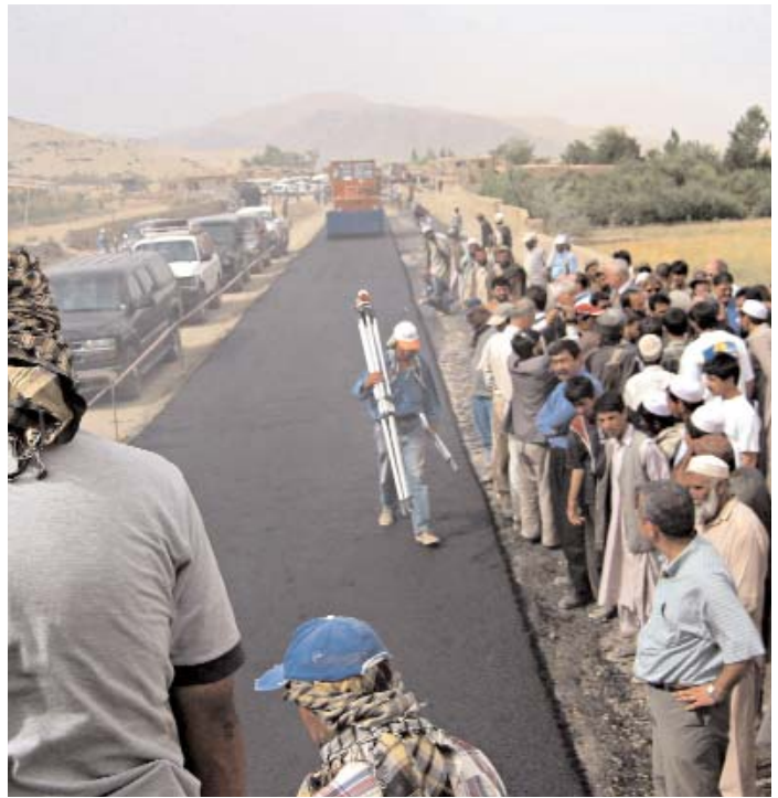
Louis Berger Group subcontracted work to five firms: one from India, three from Turkey, and one joint Afghan-U.S. enterprise.

Because it proved impossible to transport needed material through land routes, an unprecedented nonmilitary airlift was organized. Loaders, dump trucks, and bulldozers were flown in. The reconstruction also