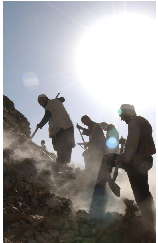
Highway reconstruction projects provide jobs for over 2,000 Afghans.

The highway will not end in Kandahar: there are plans to complete the circuit, extending it to Herat and then arcing it back through Mazar-e Sharif to Kabul. The route is sometimes referred to as the Ring Road.