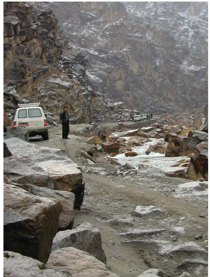
Most of the highway was in very poor condition prior to reconstruction.

try's infrastructure. Little could move along the lifeline that had provided so many Afghans with their means of livelihood and their access to healthcare, education, markets, and places of worship.