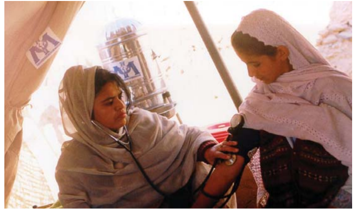
The new highway will improve access for Afghan citizens to education, business, and healthcare.

Regionally, the highway will bring Afghanistan out of its isolation by reestablishing effective links on south-central Asia trade routes. In fact, the collection of international customs tariffs could provide a much needed revenue stream for the Kabul government.