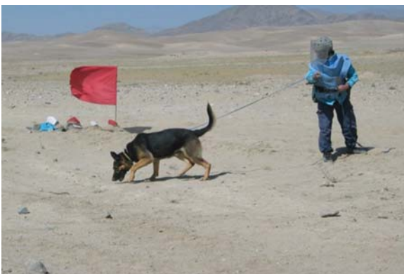
Demining operations removed over 1,000 explosive devices from the highway and adjoining areas.

The highway reconstruction was a vast multinational effort, operating under dangerous and trying circumstances and a compressed timeframe.