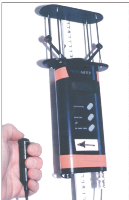
Figure 1.—Gill ultrasonic anemometer taped to the top end of an extensible pole.

Mention of any company name or product does not constitute endorsement by the National Institute for Occupational Safety and Health.