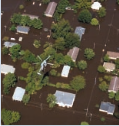
Hurricane Floyd flooded many communities in North Carolina.