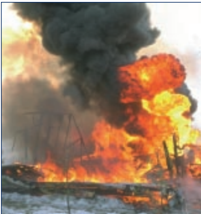
Urban fire continues to pose a significant risk in the United States.