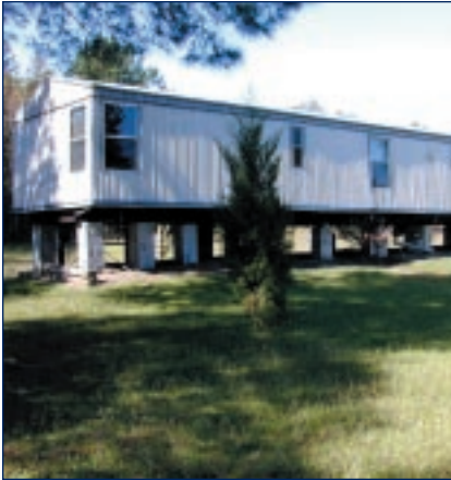
Elevation is one mitigation measure that reduces flooding risk.