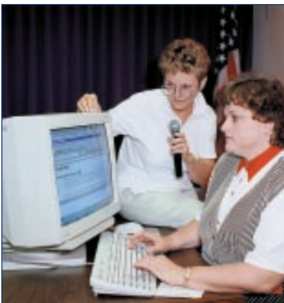
Individual training helps prepare FEMA staff to meet needs of FEMA customers.