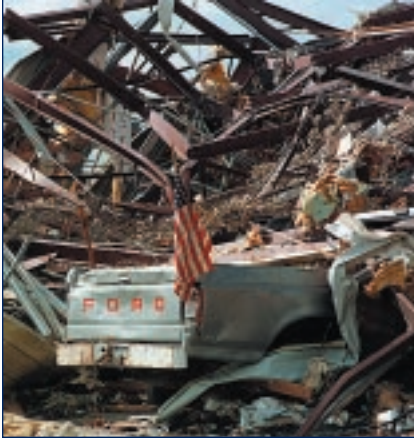
Tornadoes struck Moore, OK in May 1999, causing terrible damage.