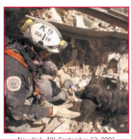
New York, NY, September 13, 2001 Urban Search and Rescue teams continue the search for survivors amidst the wreckage at the World Trade Center.