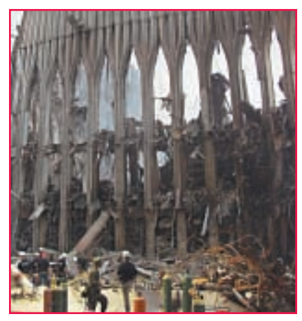
New York, NY, September 21, 2001 The World Trade Center Twin Towers were completely destroyed by the terrorist attacks on September 11. The clean up operation is expected to take months.

During FY 2001, FEMA also began a review of its FY 2000 strategic plan, and expects within FY 2002 to refocus FEMA's efforts to meet the President's management objectives and mission for FY 2003 and beyond. This will result in a review and possible revision of the FY 2003 Annual Performance Plan. Revisions will be posted upon completion on FEMA's Web site: www.fema.gov.