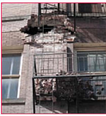
Seattle, WA, March 4, 2001 The wall supporting this fire escape has crumbled following the Washington earthquake.

The Federal Emergency Management Agency (FEMA), an independent agency reporting to the President, is charged with planning for, mitigating against, responding to, and recovering from natural and manmade disasters. FEMA was established through consolidation into one agency of the emergency management functions formerly administered by five different federal agencies. Since its founding in 1979, FEMA's mission has been clear: to reduce loss of life and property and protect our nation's critical infrastructure from all types of hazards, through a comprehensive, risk-based emergency management program of mitigation, preparedness, response and recovery.