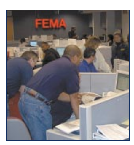
FEMA's OPS Center gears up during times of major disasters.

When it becomes clear that a hurricane or other potentially catastrophic disaster is about to occur, FEMA moves quickly. Equipment, supplies and people are pre-positioned in areas likely to be affected. That way, response can begin without delay.