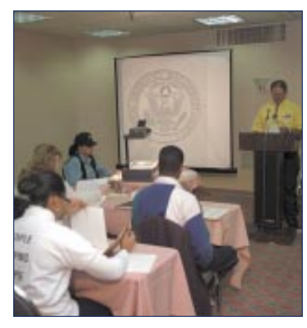
Advanced planning, preparation and training are essential to being able to best respond to disasters.