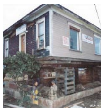
Contractors raising a house to lessen chances of flood damage.

With the goal of reducing the effect of natural disasters on our families, homes, communities, and economy, mitigation is the cornerstone of emergency management. FEMA works with state and local governments, professional groups, and the public to reduce or eliminate the risk