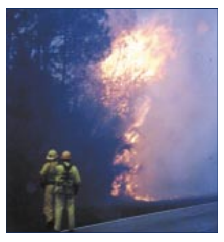
Firefighters faced tremendous challenges in containing wildfires in FY 2000.