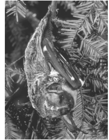
A hoary bat