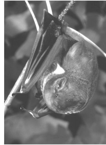
A male red bat