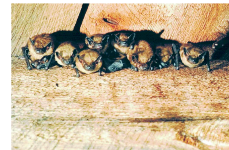
The big brown bat is found throughout most of the United States and Canada. It feeds principally on beetles.

If you think your pet or domestic animal has been bitten by a bat, contact a veterinarian or your health department for assistance immediately and have the bat tested for rabies. Remember to keep vaccinations current for cats, dogs, and other animals.