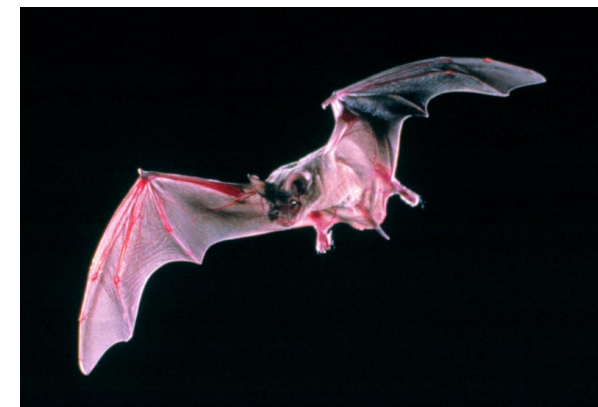
Free-tailed bats are easily recognized by their tails, which extend well beyond the tail membrane. This one is a Mexican free-tail. Its long, narrow wings are designed for speed and long-distance travel.