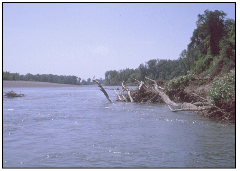
Sacramento River Bank Area

We are requesting that people interested in receiving a draft copy of the CCP/EA fill out and send in the enclosed postcard. Copies of the document can be reviewed at your local library or reviewed at our web site (see above).