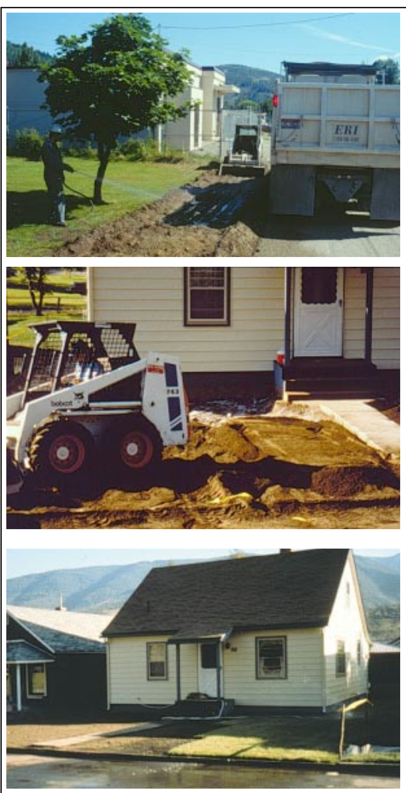
Contaminated soil was removed and replaced with clean soil at 200 residential yards at Bunker Hill in 2002.

Another $3.5 million this year went to various other projects at Bunker Hill, including planting more than 90,000 trees across 1,000 acres of affected hillsides, and closing a 260-acre former mine waste impoundment. The money was also used to clean up areas along three miles of McKinley Avenue, the main street through the site. With these cleanups complete, the street was officially returned to the City of Kellogg for reopening – something the local community has been anxiously waiting for.