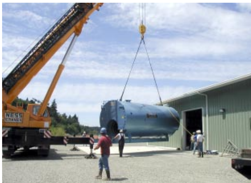
Boiler for steam injection pilot project arrives on-site at Wyckoff/Eagle Harbor.

This 8-acre former wood treating site received $4.6 million in 2002 to continue with cleanup activities, including testing of an innovative pilot project that uses steam injection to recover wood treating contaminants from soil and groundwater. The pilot system began operating in September 2002, and will continue for 12-14 months on a 1-acre area of the site estimated to contain about 60,000 gallons of creosote and other wood treating compounds. The new system is expected to treat groundwater at a much faster rate than the existing traditional pump-and-treat system. If the pilot is successful, EPA will consider expanding it for the rest of the site.