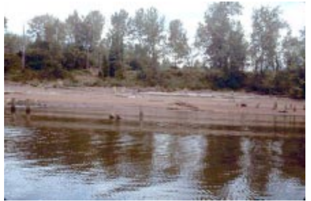
New work at McCormick & Baxter site will keep contamination out of nearby Willamette River.

EPA awarded $4 million to the Oregon Department of Environmental Quality (DEQ) to build a barrier wall that will prevent creosote contamination at the former McCormick and Baxter wood treating site from entering the Willamette River. The new wall will extend underground and encircle 16 acres of the site containing the most significant sources of groundwater contamination. DEQ, the lead agency for managing cleanup at the site, expects to award a construction contract by December 2002 and complete construction by May 2003.