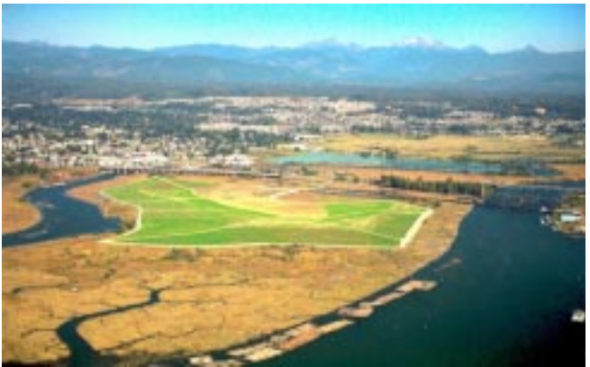
A bird's eye view of the new protective cap at Tulalip landfill

Environmental monitoring at the 147-acre former Tulalip Landfill has shown the cleanup remedy to be effective in preventing further contamination of nearby wetlands, and the site has been deleted from the NPL. An estimated four million tons of commercial and industrial waste was put in the unlined landfill between 1964 and 1979, which was later found to be seeping contamination into the adjacent wetlands.