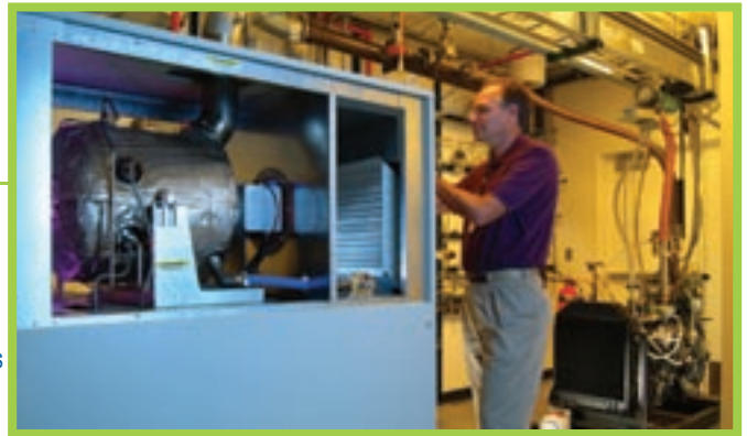
Jim Yost Photography/PIX 12666

The Thermochemical Users Facility's generator test cell allows analysis and direct comparison of emissions and operating characteristics for electrical generation by a gas turbine (foreground), an internal combustion generator (background), or a fuel cell, with biomass gas generated by different processes or from different feedstocks.