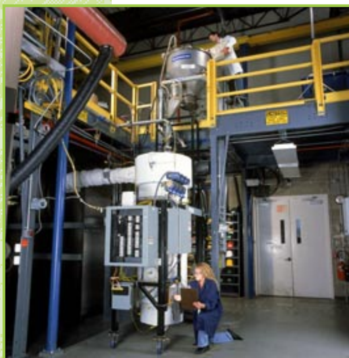
PIX 12684

The key components in the TCUF are the Thermochemical Process Development Unit (TCPDU), the Catalyst Testing Unit, and the Generator Test Cell. The TCPDU can be integrated with downstream Catalytic Synthesis Units to produce fuels and chemicals, or with the Generator Test Cell to produce electricity.