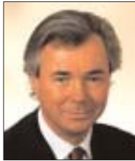
PIERRE S. PETTIGREW

Minister for International Trade, Canada