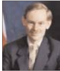
ROBERT B. ZOELICK

Minister for International Trade, Canada