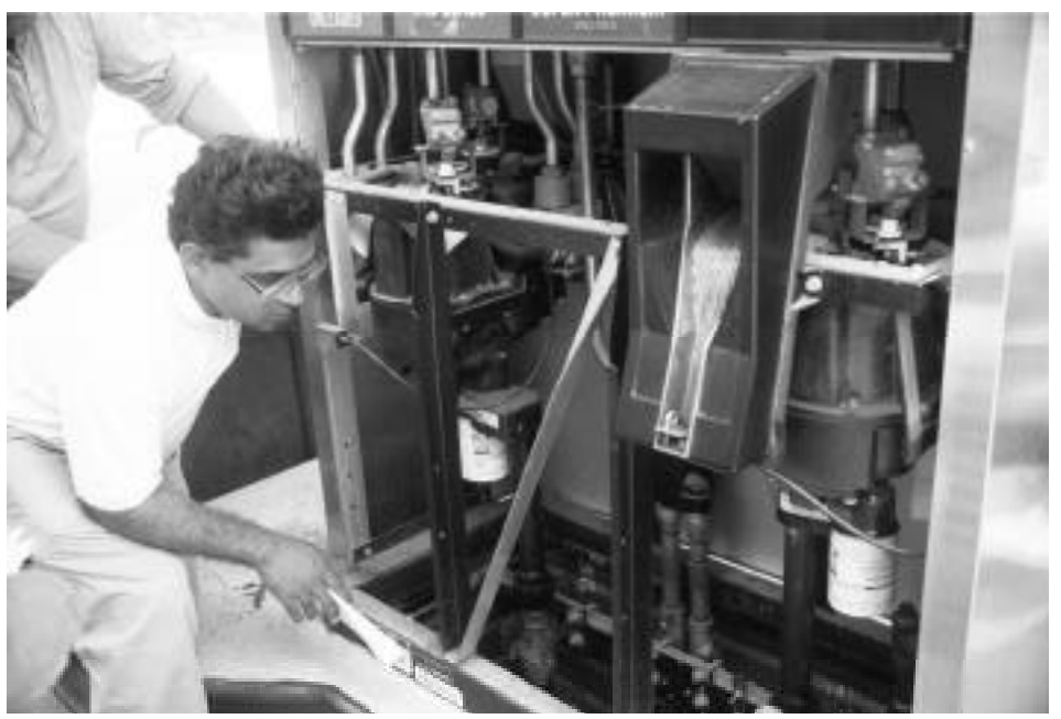
Inside the Pumps

deliveries and pressure deliveries was discussed to emphasize how important it is for federal facilities in particular to know whether their fill-pipes are pressure-rated. Most DoD fuel deliveries are pressurized. The consequences of a pressurized fuel delivery being made in a non-pressure rated fill-pipe could be serious.