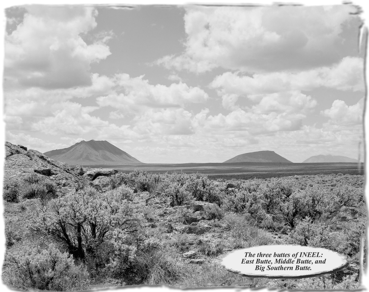
The three buttes of INEEL: East Butte, Middle Butte, and Big Southern Butte.