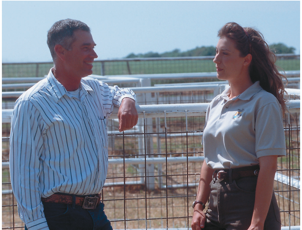
Service biologists work with landowners to conserve species on private lands.

Stewardship: the careful and responsible management of something entrusted to one's care.