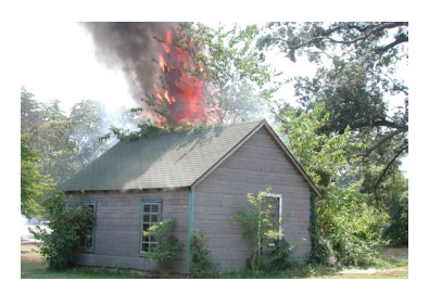
Fire spreads to small structure from burning trees and shrubs.