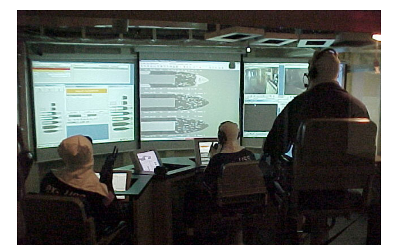
Ex-USS Shadwell Damage Control Central (DCC) with Intelligent Supervisory Control System (SCS)

firefighting capabilities rely heavily on sailors, alternatives need to be developed. The Damage Control-Automation for Reduced Manning (DC-ARM) Program was initiated by the Office of Naval Research and conducted by the Naval Research Laboratory and Hughes Associates, Inc. The objective is to demonstrate the viability of automating the elements of the damage control related to