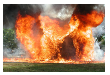
An intense fire involving asphalt based shingles and siding spreads to the grass surrounding the building.