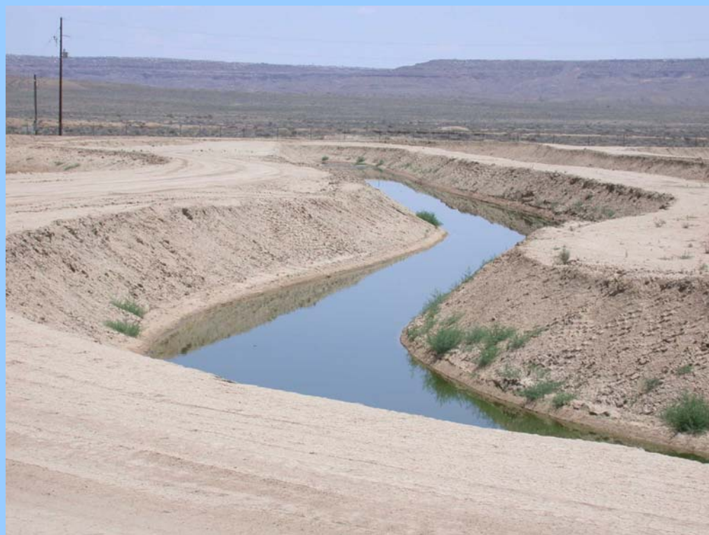
Final stages of the Kykotsmovi Sewage Lagoon / Wetland Treatment System.