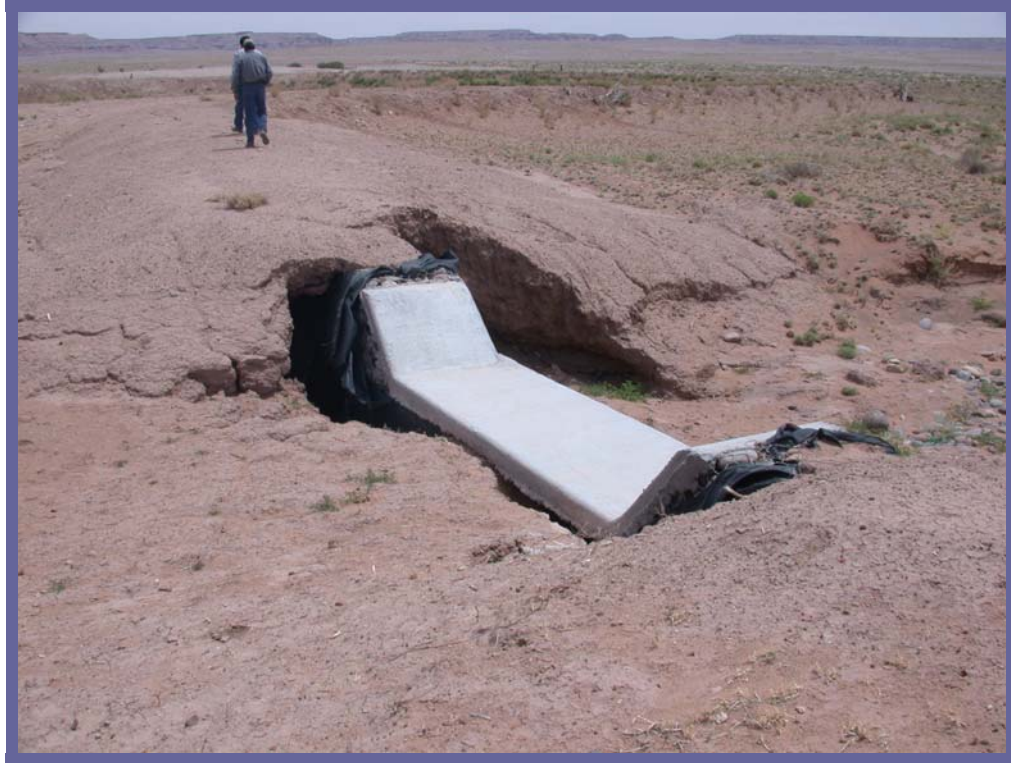
Cameron-4 Maintenance Project – 100 Yr. Flood Event .