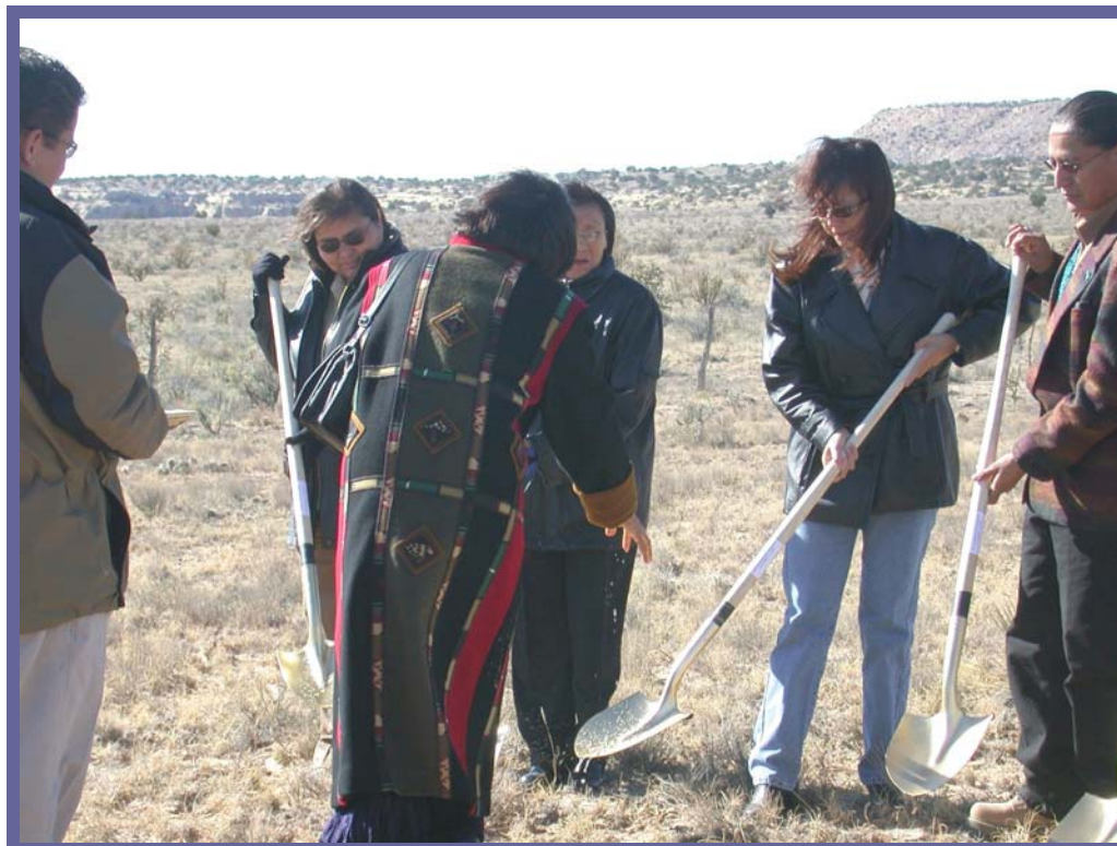
Tohajiilee / Canyoncito Ground Breaking & Blessing