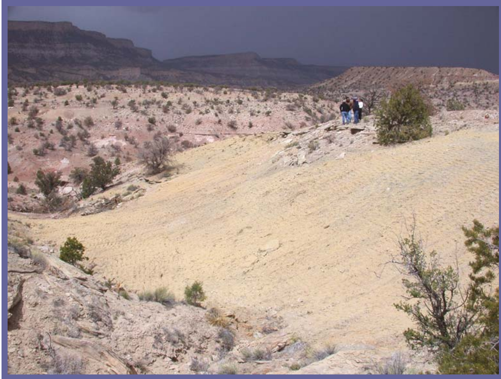
Black Mesa AML Reclamation Project (Central contract).