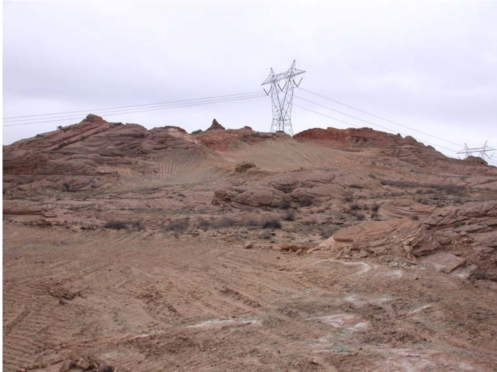
Coppermine AML Reclamation Project, highwall elimination.