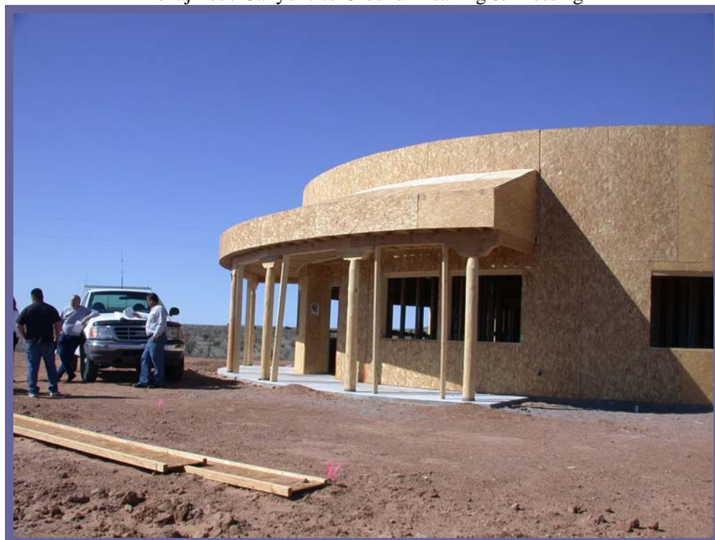
Tohajiilee Mental Health Center under construction