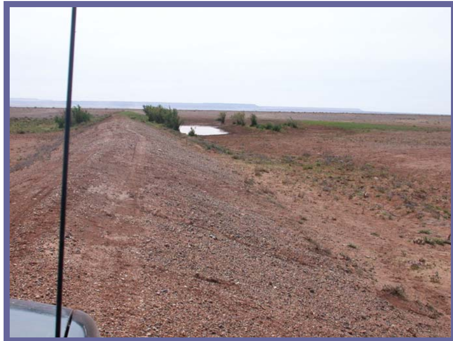
Cameron-6 AML Maintenance Project – Dam