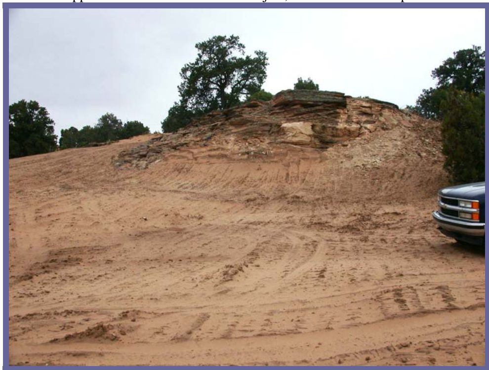
Coppermine AML Reclamation Project, backfill closure of portal.