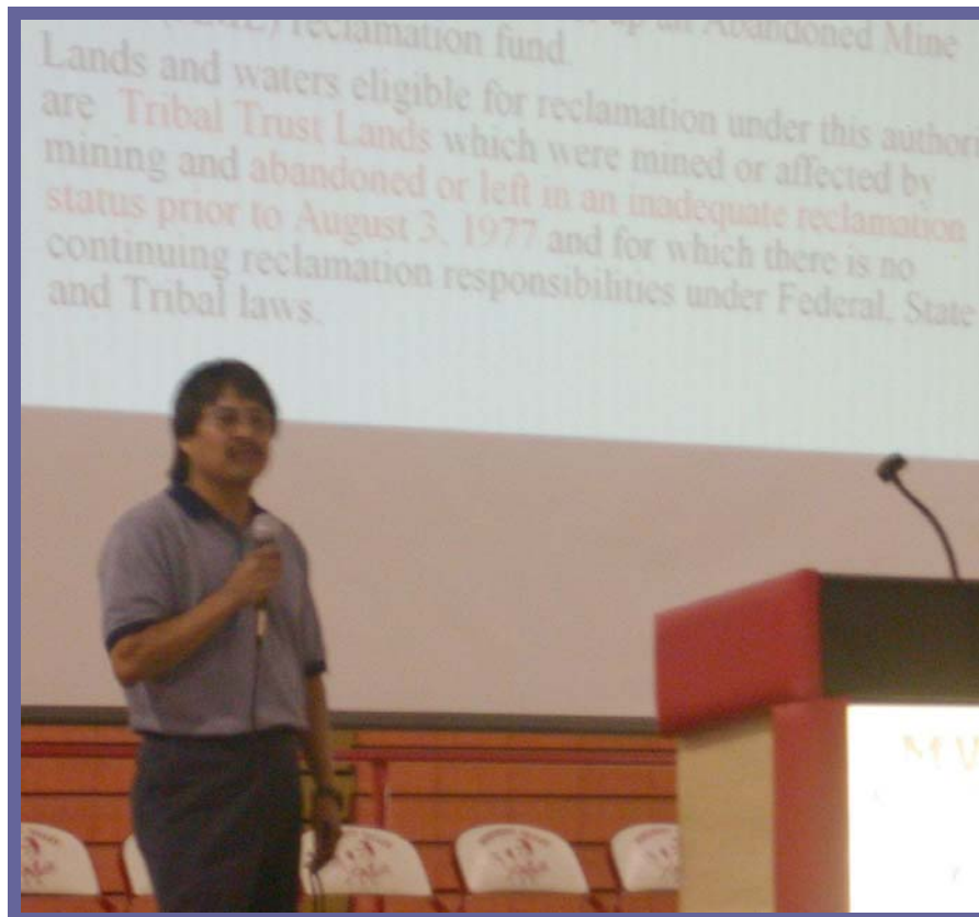
Public Outreach – Uranium Meeting