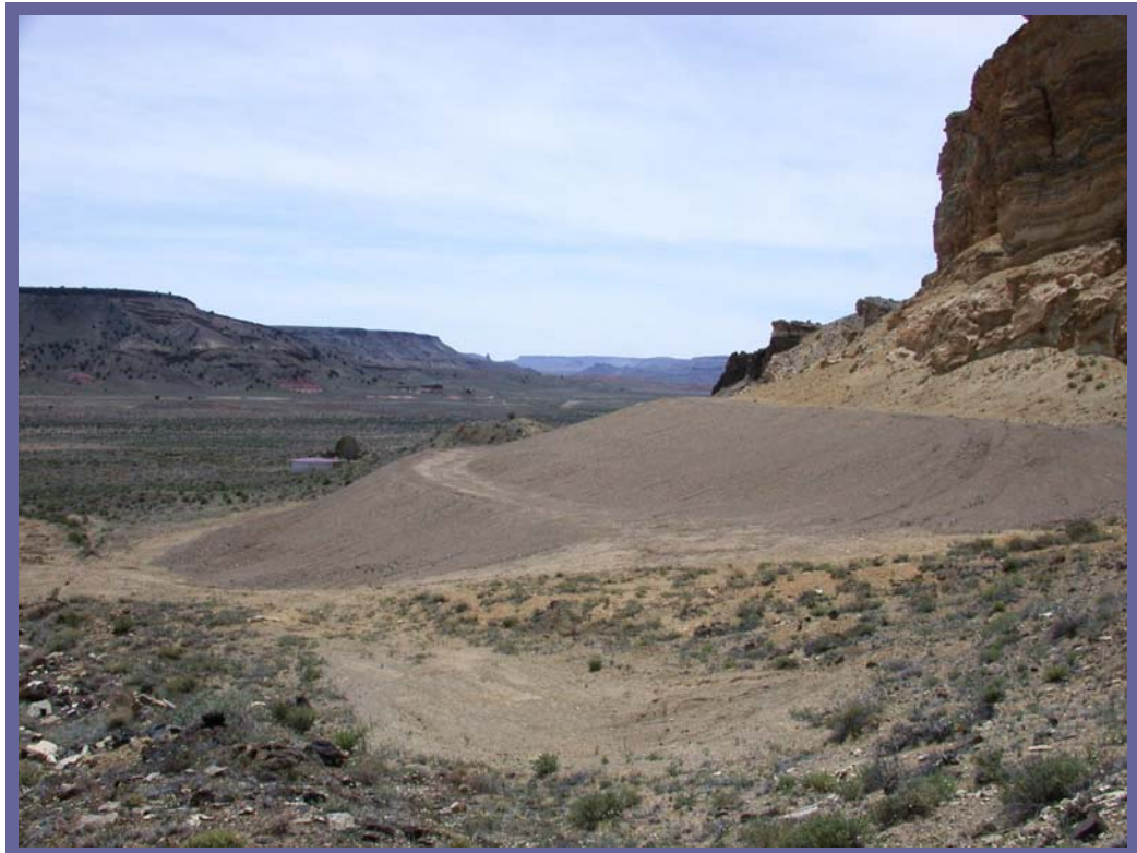
Bidahochi AML Reclamation Project (Central contract).