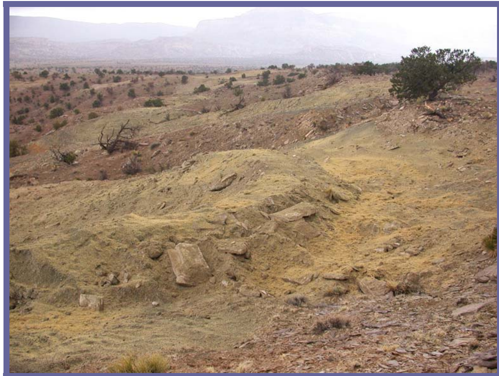
Black Mesa AML Reclamation Project (Central contract).