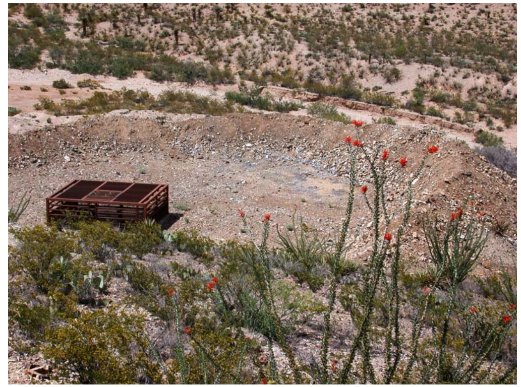
Orogrande Safeguard Reclamation Project – Berm used to control runoff and also serves to hide the bat cupola from view of visitors on the roads below.