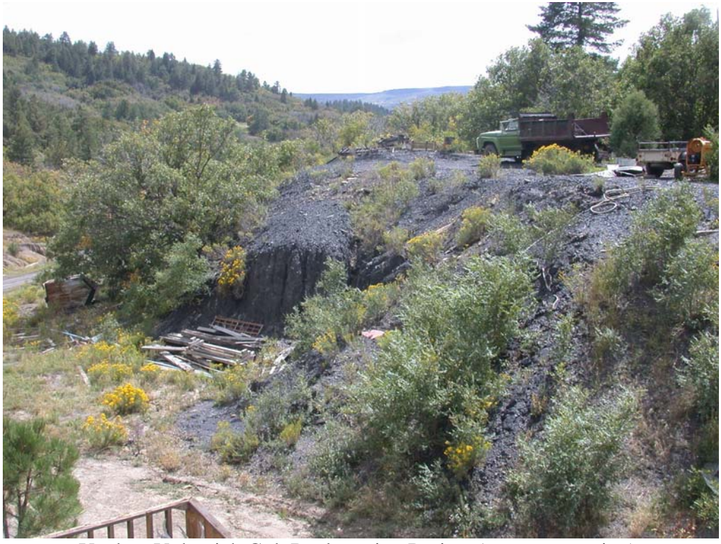
Yankee-Vukonich Gob Reclamation Project (pre-construction).