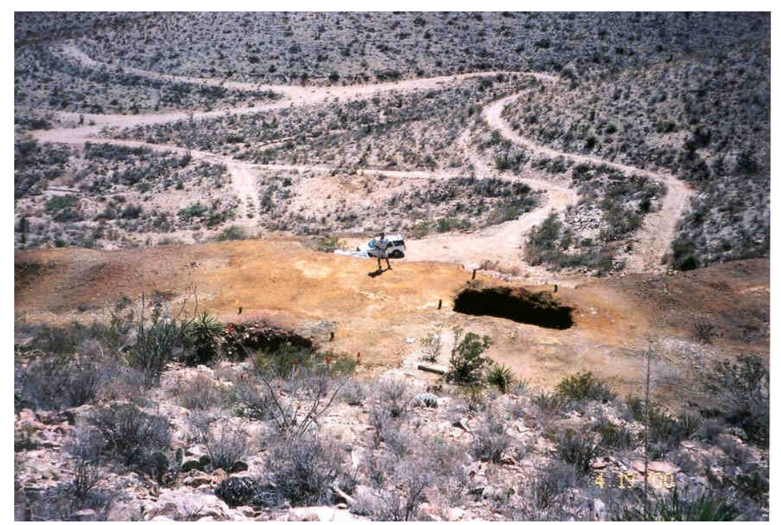
Orogrande Safeguard Reclamation Project - Garnet Mine (Pre-construction).