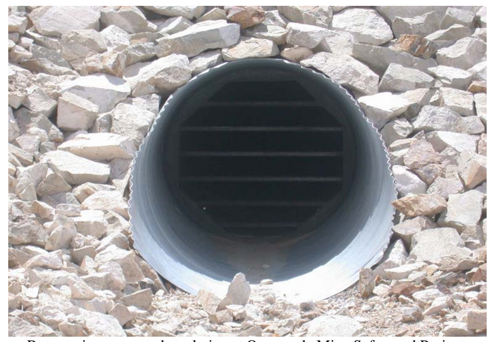
Bat gate in corrugated steel pipe at Orogrande Mine Safeguard Project.