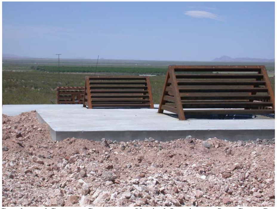
Bat Cupolas and Concrete Covers over Vertical Openings at Spar Group Project.