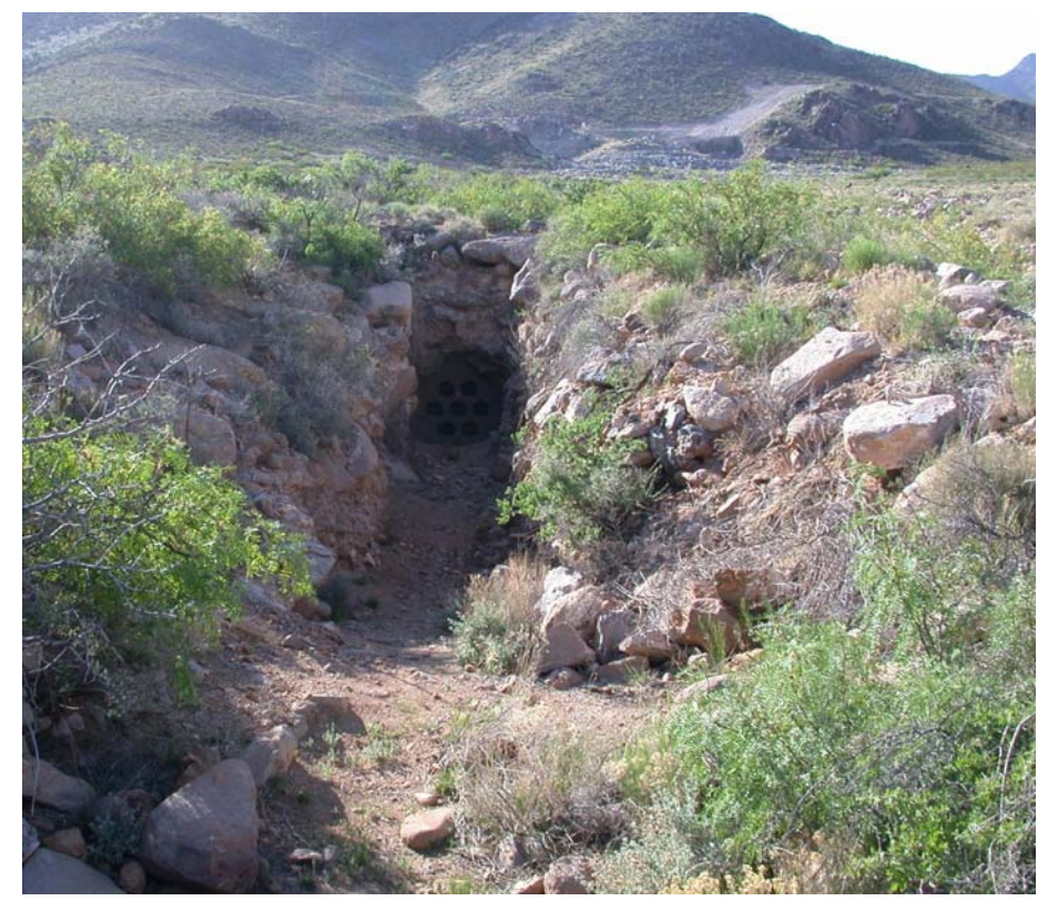
Pipe Array Drainage for Under Ground Workings at Stevenson Bennett Mine Project.