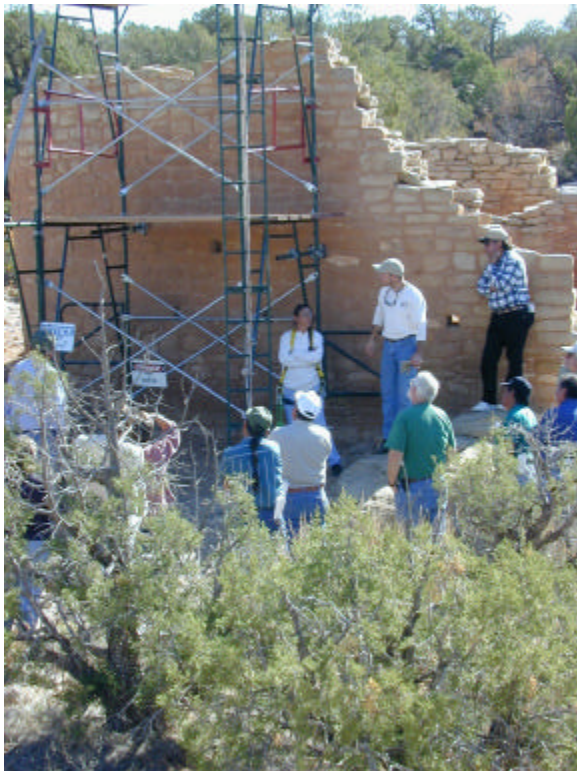
Salinas Pueblo Missions Preservation Crew Giving Scaffold Safety Training at 2000 VT Conference, Hovenweep National Monument, UT.

accomplish their work. With this focus, the entire crew, including seasonals, attended scaffold user training in Albuquerque. The permanent staff attended a Primary Access Training (PAT) for scaffold set-up. Our experience with this new scaffold system allowed us to assist Pecos National Historical Park in setting up their newly purchased scaffold. At the season end, Salinas personnel participated in the Annual VT Conference held in Blanding, Utah and conducted a brief training session on fall protection and scaffold use.