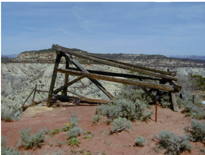
Cable Mountain Draw Works, Zion National Park, UT.

Preservation treatment of the Draw Works was accomplished by seasonal cultural resources staff, funded through VT, in consultation with historical architects in the Intermountain Region Support Office – Denver and the Utah Division of State History. A NPS structural engineer provided input as well. While FY 2000 treatments did not address long-term structural stabilization needs, it did provide for better documentation of the structures' condition, rectify some immediate safety concerns, and slow down deterioration processes affecting original fabric.