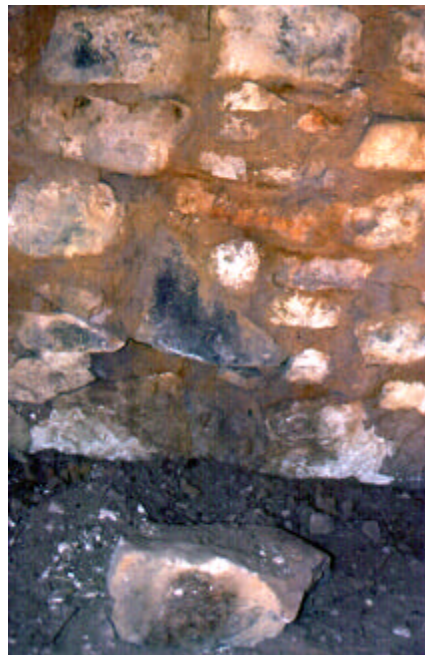
Room C, WACA 162 After Repair, Walnut Canyon National Monument, AZ.

As part of the same cooperative agreement with NAU, NPS archeologists and NAU students conducted intensive architectural documentation projects on three sites at Wupatki. Antelope House Ruin, Kaibab House, and Heiser Ruin were photographed on a wall-by-wall basis. The photos were digitized and annotated in the field to document impacting agents, current condition, and areas of previous treatment. In addition to detailed photography, a documentation and assessment form was completed for each wall. Finally, room maps and cross section profiles were completed as part of the documentation package. In conjunction with field documentation, records research was completed for the three sites and will be incorporated into comprehensive reports.