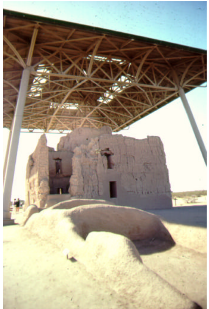
Casa Grande Ruin, Casa Grande Ruins National Monument, AZ.

Program Management funds in FY 2001 will be $60,000. It is expected that the funds will be utilized in a manner similar to the previous fiscal years. Some of the funds will be used to support the VT-wide activities of the recently hired Structural Engineer.