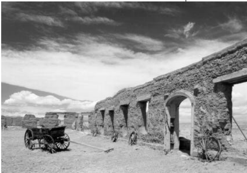
Fort Union National Monument, NM

Table 2.1 provides the total amount and a breakdown of funding that has been allocated to VT since FY 1998 through FY 2001. It identifies the increases that have been provided to VT over the last four years and where funds have and will be distributed to the primary funding components (projects, program management base increases for personnel, and).