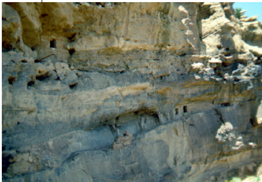
Balcony House, Canyon De Chelly National Monument, AZ.

Monument. These sites contain an incomparable architectural record that reflects almost the entire occupational history of Canyon de Chelly. These include Basketmaker houses and storage facilities approximately 1500 to 2000 years old, somewhat later Ancestral Puebloan small house sites, large masonry villages, and an array of isolated kivas or kiva complexes. In addition, there are domestic structures, stock enclosures, and defensive fortifications that represent an array of historic Navajo architecture. The majority of these rich architectural sites is situated in well-protected dry alcoves that facilitate the preservation of fragile remains. However, these same alcoves have provided a haven for livestock and other animals, and have attracted visitors throughout the past century. These factors of deterioration, along with natural processes of erosion, have resulted in toppled walls, undermined foundations, destroyed architectural features, and outright vandalism.