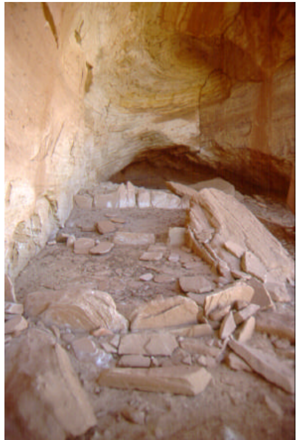
Basketmaker Architecture ca. 600 AD, Canyon De Chelly National Monument

Formulation of the FY 2002 budget for VT is currently underway. It is expected that a request will be submitted that makes available levels of funding to hire new staff that are consistent with what we have seen in the first three years (FY 1998-2000) of the Program. It is hoped that we will be able to hire an average of 12 new staff members on a yearly basis.