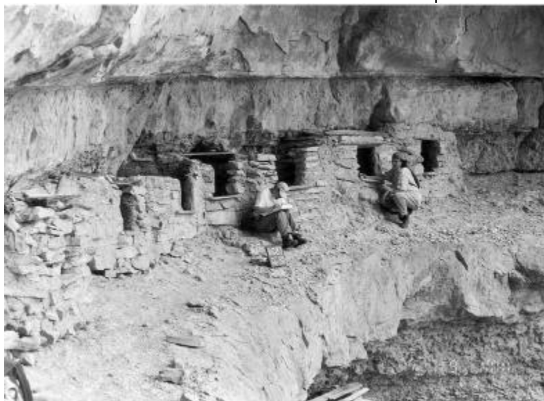
Documenting Ancestral Puebloan Structures, Grand Canyon National Park, AZ.

In FY 2000 Grand Canyon National Park received Vanishing Treasure project funds to complete condition assessments, architectural documentation, mapping, and photographic documentation of masonry archaeological sites located in the park's backcountry. The project is being completed under a cooperative agreement with Northern Arizona University (NAU) and will be conducted through FY2001. Many of the backcountry project sites are located along developed trails, in popular remote backcountry use areas, and are mentioned in several trail guides. The project will document selected sites in Cottonwood Canyon, Upper Ribbon Falls, Dripping Springs, Walhalla Plateau, Walla Valley, Desert View and along the Colorado River Corridor. Sites included in the project vary from granaries to eighteen room cliff structures with partially intact roofs. Condition assessments will be completed for 26 sites, and pre-stabilization documentation will be completed (including total station mapping) for the Bright Angel Ruin. The information obtained through assessment and documentation of these sites will allow park managers to prioritize future preservation actions, and provide the baseline data necessary to develop appropriate preservation plans and treatments.