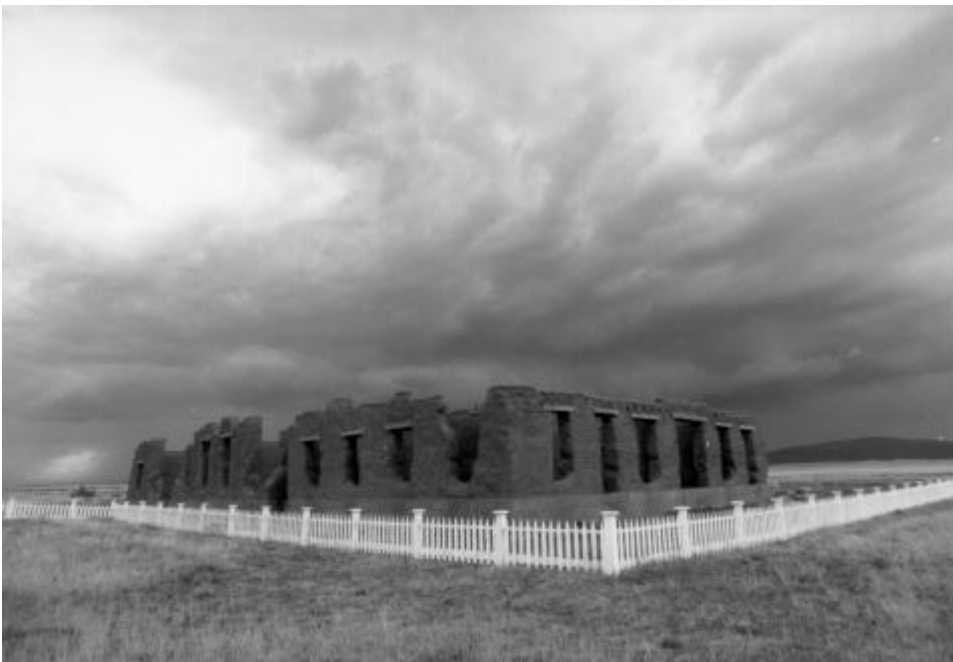
Historic Post Hospital, Fort Union National Monument, NM