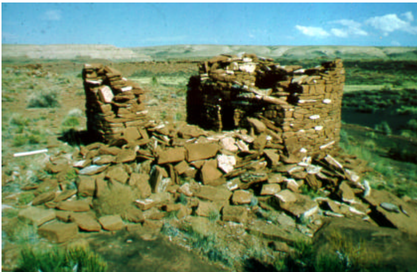
13 th Century Ancestral Puebloan Site, Wupatki National Monument, AZ.