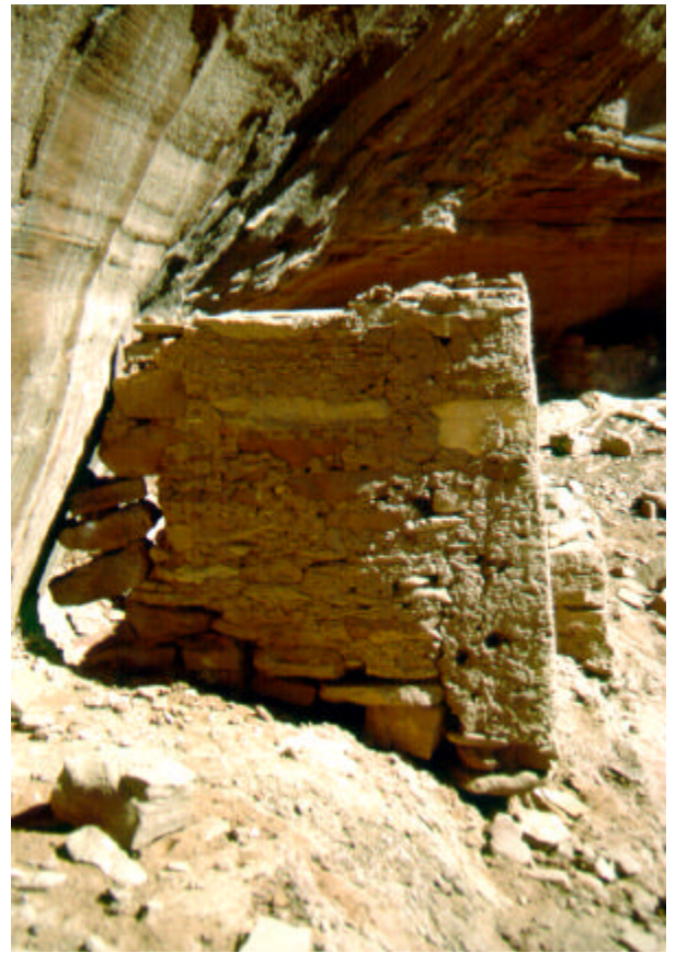
Threatened 13 th Century Architecture, Canyon De Chelly National Monument, AZ.

If VT is to be successful far beyond what we have seen to date, funding levels to hire personnel and to conduct projects, at the very least, needs to be consistent with what was seen in the first three years of the program, if not increased. The continued success of VT and the ability to hire new staff is dependent upon consistent levels of funding for projects and annual increases in order to be able to hire needed personnel. Any reductions in the budget means that the ability to continue to address the already overwhelming backlog of preservation needs will stagnate, and we will cease to have the ability have in place the necessary workforce to address the continuing preservation needs of the Nation's Vanishing Treasures.