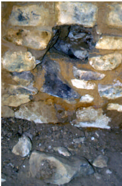
Room C, WACA 162 Before Repair, Walnut Canyon National Monument, AZ.

intensive mapping project of all front country interpreted sites at Wupatki National Monument. Flagstaff Area archeologists have been working with Dr. Chris Downum of NAU, and Jim Holmund of Geo-Map Inc., in Tucson, AZ, to produce technical mapping products as part of an intensive architectural history project being conducted for all front country sites at Wupatki. Specific products include photogrammetric mapping of landforms to produce 20cm contour maps and digital elevation models (DEMs) of the project area. Architectural remains were mapped using GPS base stations to achieve 1cm accuracy. Other architectural features and structures associated with the sites were mapped using trilateration techniques. All products were digitized for use in AutoCAD and GIS applications. In FY 2000, the focus was on mapping Citadel Ruin and Nalakihi Pueblo, two sites with extensive treatment histories but lacking detailed planimetric maps. In addition to these two sites, work initiated in 1999 on Lomaki Pueblo and the Box Canyon Sites was finalized.