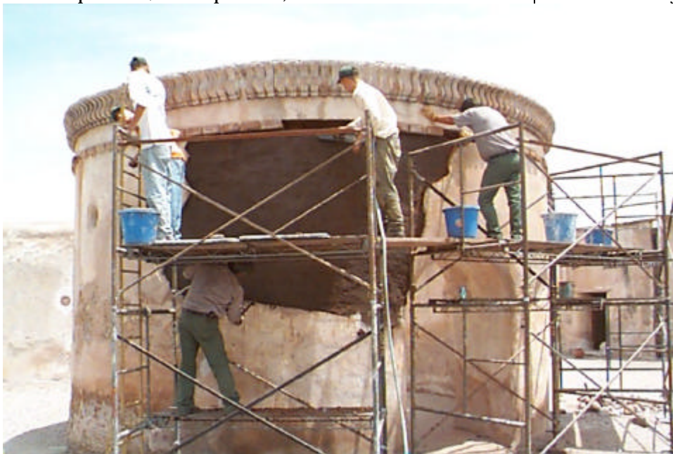
Tumacacori Preservation Crew Repairing Adobe, Tumacacori National Historical Park, AZ.

San Antonio Missions National Historical Park (1 intake position, craft specialist)