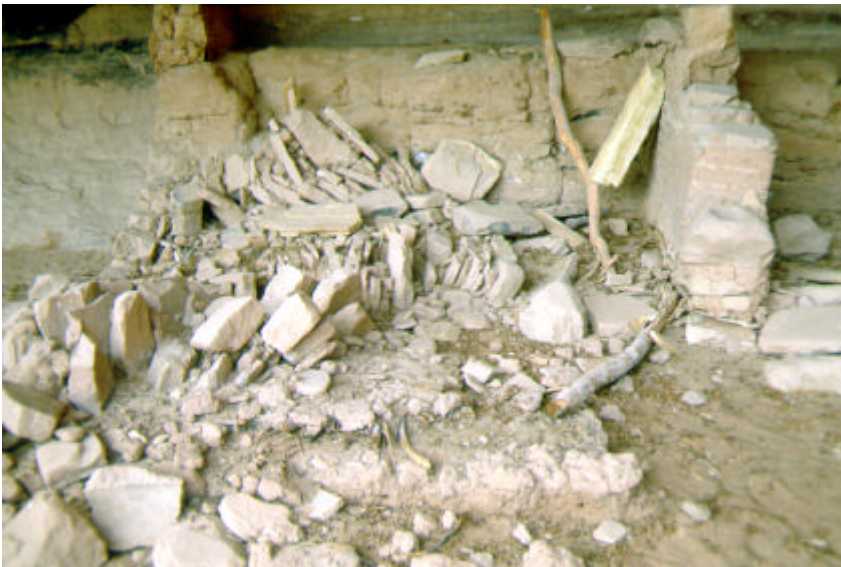
Collapsed 13 th Century Architecture, Canyon De Chelly National Monument, AZ.