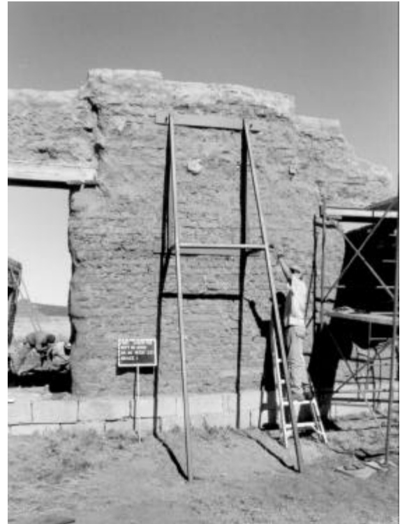
Replacing Braces, Fort Union National Monument, NM.

were installed on the sides of walls opposite the visitor paths. Where it was necessary to install braces behind door or window openings, the braces were splayed to keep them from view on the opposite side. The crew was able to finish nearly all the bracing tasks identified for FY 2000.