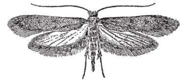
Case-making Clothes Moth

As with clothes moths, the larval stage is the most damaging. Females lay eggs throughout the year and the eggs hatch after less than two weeks. The larvae feed for varying periods, depending upon the species and the environmental conditions. When ready to pupate, the larvae may burrow farther into the food or wander and burrow elsewhere. They may also pupate within their last larval skin or burrow into wood if no