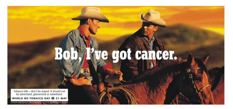
FIGURE 1. "Bob" from "Don't Be Duped," No-Tobacco Day Message, 2000

tion about World No-Tobacco Day 2000 is available at WHO's World-Wide Web site, http://www.who.int/toh/media/wntd2000/wntd2000.htm*, and at CDC's Office on Smoking and Health, National Center for Chronic Disease Prevention and Health Promotion site, http://www.cdc.gov/tobacco, or telephone (800) 232-1311. References