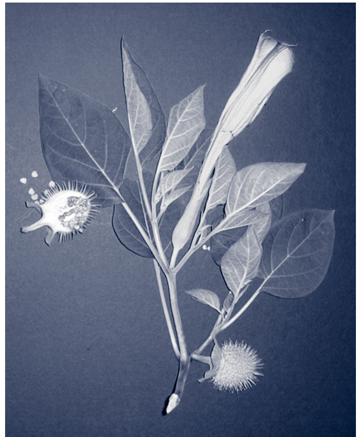
FIGURE. Datura innoxia , one of several plants known commonly as “moonflowers”