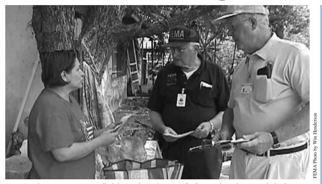
FEMA and state representatives walked door-to-door to be certain flood victims know how to apply for disaster recovery assistance.