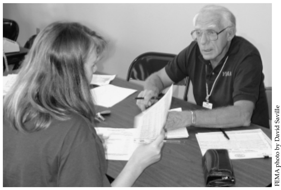
An applicant gets assistance from a FEMA worker at a Disaster Field Office

Disaster recovery assistance is available without regard to race, color, sex, religion, national origin, age, disability or economic status. If you or someone you know has been discriminated against, you should contact the federal or state Equal Rights Officer.