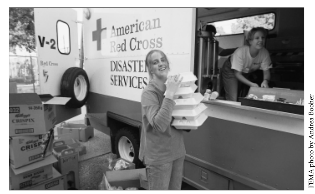
Meals provided by a Red Cross volunteer bring a smile to the face of a flood victim in Darby.