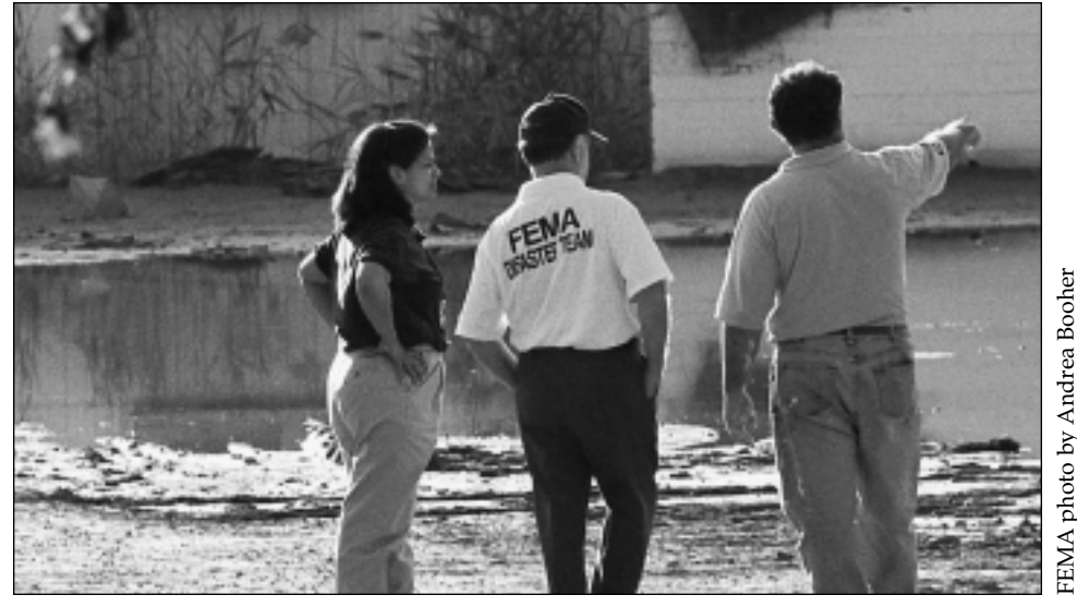
A FEMA disaster team member and local residents check out flood damage in Darby.

esidents of Lycoming county understand the dangers of water. More than 2.200 miles of streams flow through the county, the most of any Pennsylvania county. Six major tributaries of the Susquehana River flow through all the major settlements. These rivers, creeks and streams have steep slopes that produce high velocity floodwaters.