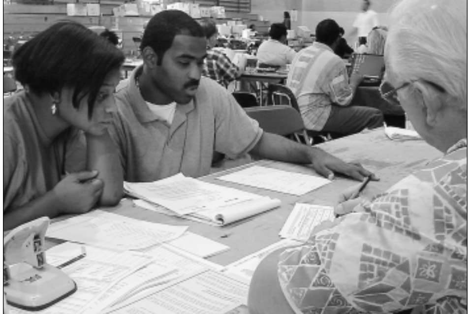
A Small Business Administration counselor works with clients at a Disaster Recovery Center in Philadelphia County.

Disaster recovery assistance is available without regard to race, color, sex, religion, national origin, age, disability or economic status. If you or someone you know has been discriminated against, you should contact the federal or state Equal Rights Officer.