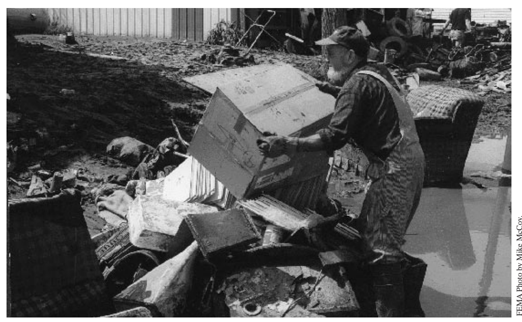
Damaged belongings pile up along the streets during the clean-up in Littleport, Iowa.

The debris left behind by the storms may be a source of injury or illness. Be careful when cleaning damaged structures or handling debris. Here are some safety tips: