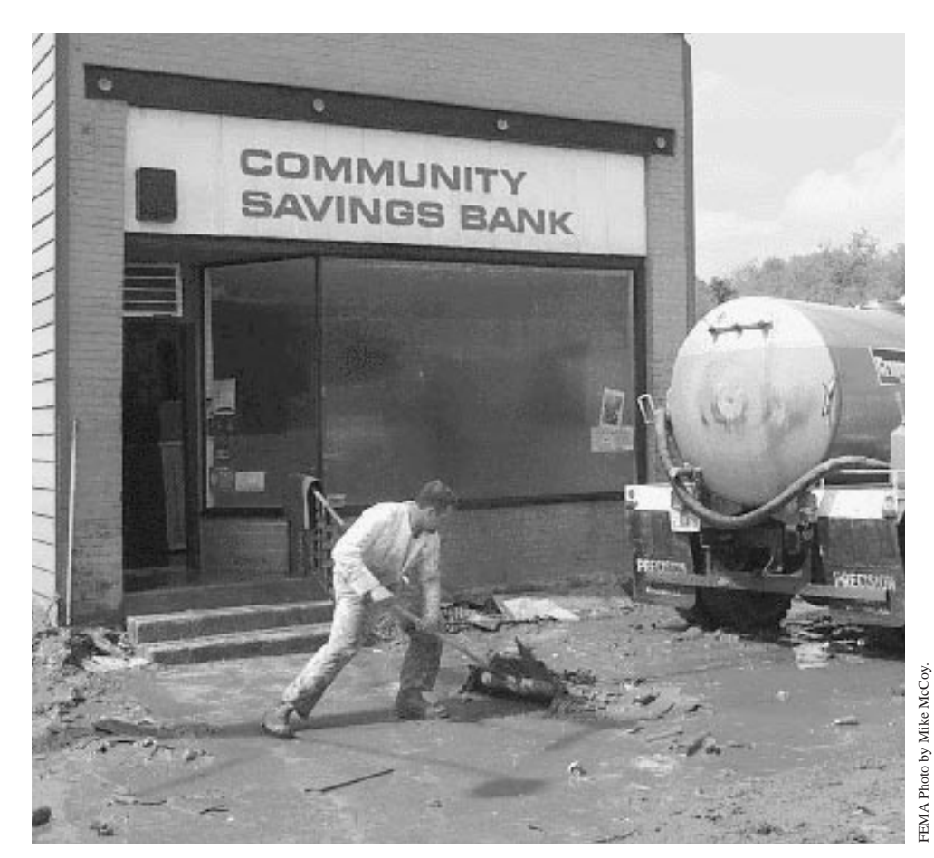
Recovery begins after floods in northeast Iowa.

You may be eligible for other disaster assistance programs. To find out, call 1-800-462-9029 (TTY 1-800-462-7585 for the speech and hearing impaired).