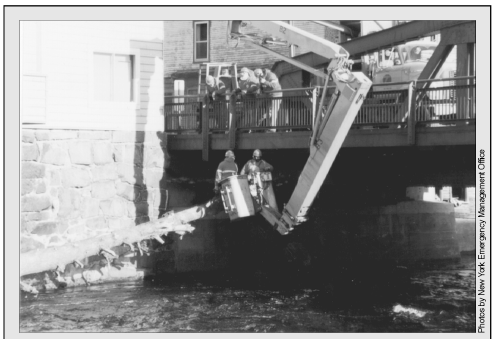
New York state transportation workers cut tree lodged in bridge in AuSable Forks.