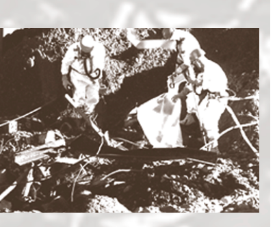
CleanupNews is a quarterly newsletter highlighting hazardous waste cleanup cases, policies, settlements, and technologies.