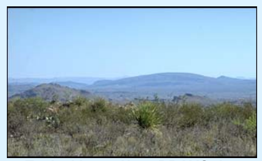
Typical Least Hazy BRAVO day

Sulfates contribute approximately 50% of the light extinction at Big Bend National Park