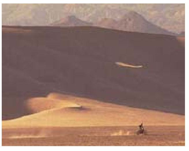
Dunes rider in the California Desert

Plan contact: Connell Dunning, 760-251-4817