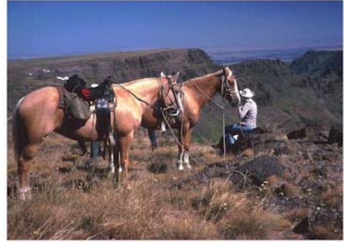
Horseback Riding on Steens Mountain, OR

ePlanning provides a new approach to land use planning that encourages an openly participative, collaborative, and communitybased land use planning process.