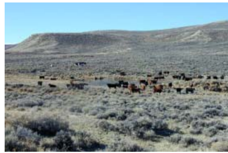
Livestock grazing, Jack Morrow Hills, WY

BLM will develop a "Best Practices Manual" for transferring land use planning information for current planning efforts into the ePlanning system. This manual will include practical advice such as hardware and software requirements, data types, and tips on preparing text and map data for conversion into this system.