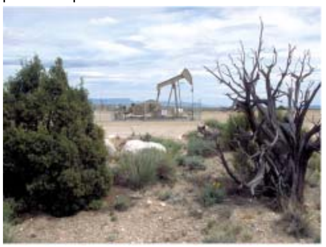
Coalbed Methane Development in the Price RMP Planning Area, UT

In addition, citizens can manipulate spatial data/information without further BLM involvement, thus increasing the value of the business process. This effort ultimately promotes collaboration, reduces duplicative efforts, saving money, and forms cost-sharing partnerships.