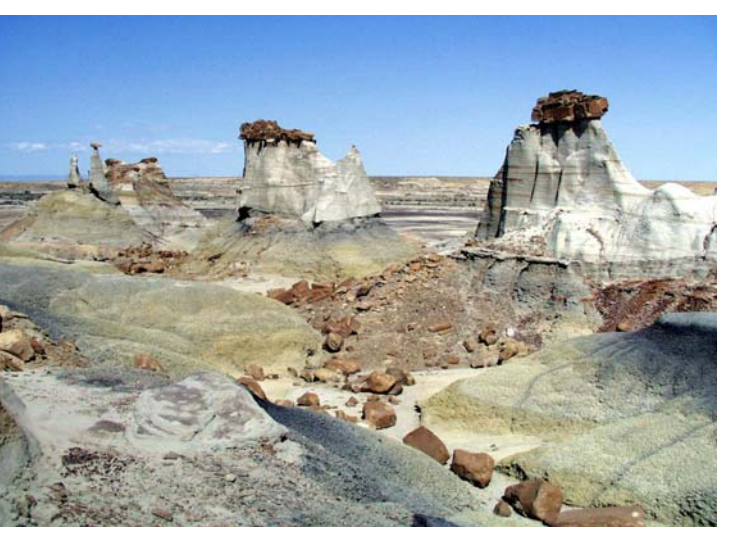
Wind carved rock towers in northern New Mexico's Bisti Badlands

The ROD also commits the BLM to continue support of air quality monitoring, modeling, and future mitigation of emissions from natural gas