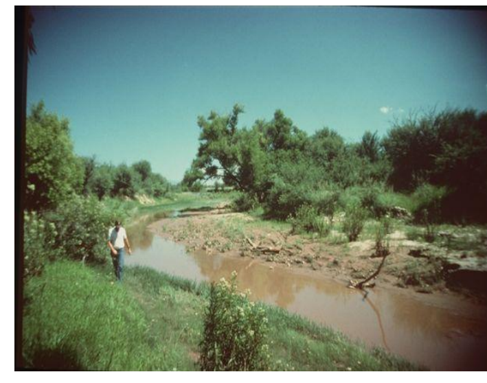
Las Cienegas NCA, in southeastern Pima County and northeastern Santa Cruz County, Arizona