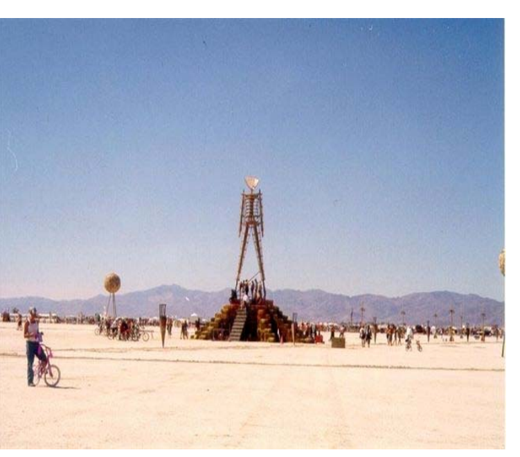
Burning Man before being burned, Black Rock/High Rock NCA, Nevada

Plan contact: Floyd Johnson, 435-636-3600