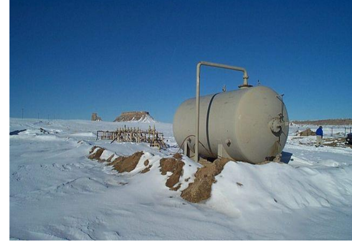
Natural gas liquids storage tank in winter, San Juan Basin, New Mexico

compressors. It also implements a policy to reduce noise impacts from compressors and outlines a series of mitigation measures designed to minimize the environmental impacts related to oil and gas development.