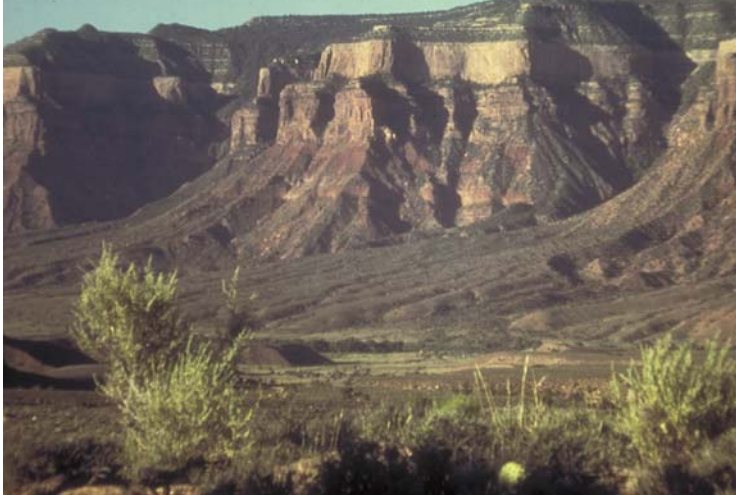
Cliffs of the Roan Plateau, northwest Colorado

Plan contact: Melissa Bristow, 760-251-4800