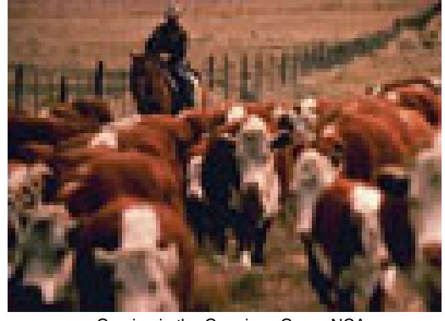
Grazing in the Gunnison Gorge NCA