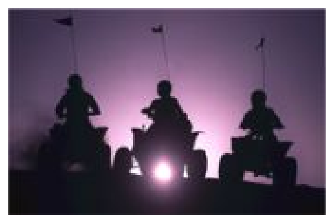
ATV riders at sunset, Imperial Sand Dunes, CA

Plan contact: Lynette Elser, 760-337-4420