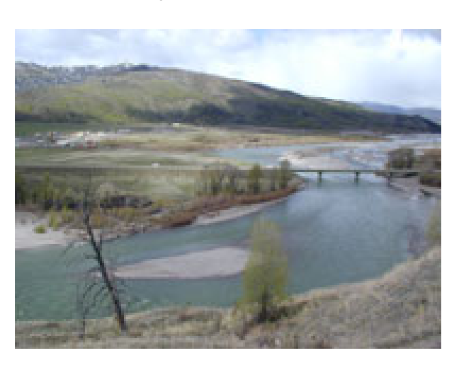
View of the Snake River, Wyoming

Plan contact: Floyd Johnson, 435-636-3600