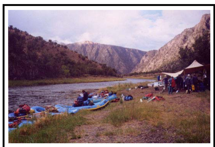
As part of a focus group, BLM led participants on an overnight rafting trip of the Gunnison Gorge NCA. Here, the trip participants gather at Ute Camp on the Gunnison River.

The public collaboration program implemented for this effort included the distribution of a newsletter, three public open houses, and a public collaboration focus group. During this process, sixteen Planning Criteria were developed and reviewed by the public.