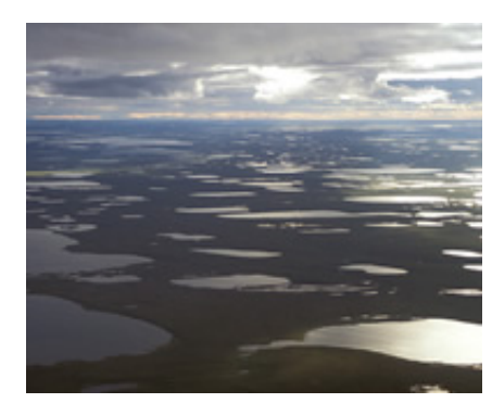
Northern National Petroleum Reserve Lakes, AK