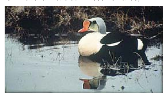
King Eider, NW National Petroleum Reserve, AK

key rivers (16 percent of planning area), and in the Kasegaluk Lagoon Special Area