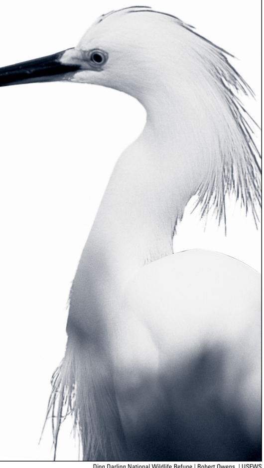
Ding Darling National Wildlife Refuge

Although waterfowl production areas, easements, and National Wildlife Refuges account for less than 2 percent of the landscape in the prairie pothole region states, they are responsible for producing nearly 23 percent of this area's waterfowl. That is why working with private landowners through voluntary partnerships to enhance wetlands is so critical to protecting waterfowl.