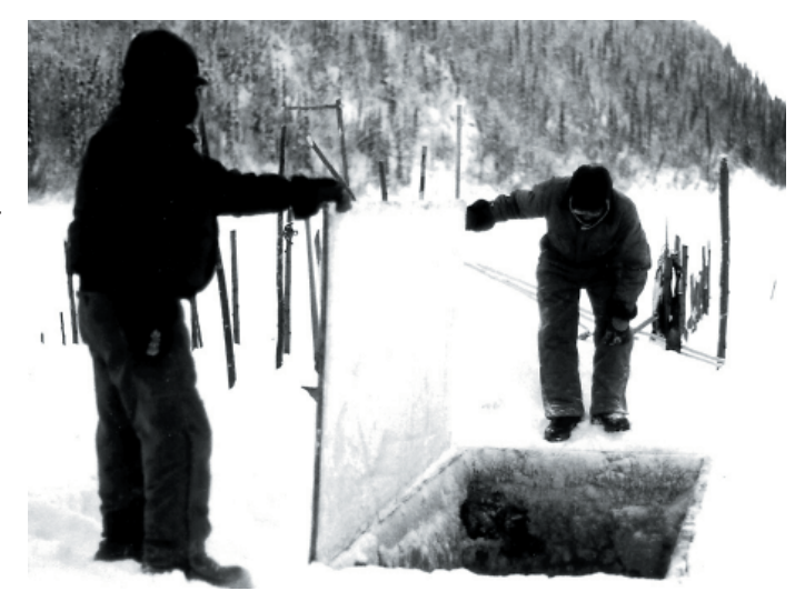
The community burbot trap near Hughes, January 2002

For a copy of "Traditional Ecological Knowledge and Contemporary Subsistence Harvest of Non-Salmon Fish in the Koyukuk River Drainage, Alaska," contact Polly Wheeler, Ph.D, at (907) 786-3888 or (800) 478-1456, or by e-mail at polly wheeler@fws.gov.