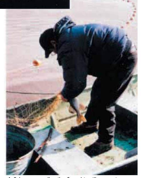
A fisherman pulls pike from his gillnet set in an ice-free channel of the Koyukuk River.