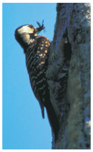
Red-cockaded woodpecker

If the Federal action agency determines that a project may adversely affect a listed species or designated critical habitat, formal consultation is required. There is a designated period of time in which to consult (90 days), and beyond that, another set period of time for the FWS to prepare a biological opinion (45 days). The determination of whether or not the proposed action would be likely to jeopardize the species or adversely modify its critical habitat is contained in the biological opinion. If a jeopardy or adverse modification determination is