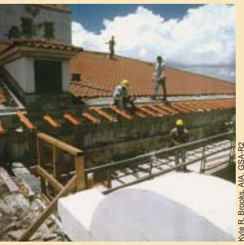
The General Services Administration reconstructed the original 1914 roof overhang of the U.S. Post Office and Courthouse, San Juan, PR, as well as constructing new courtrooms and prisoner circulation space to enable the expanding U.S. District Court to remain in its historic location.

Having a thoughtful agency historic preservation program is good public policy—it can save time and money in carrying out the government's responsibilities, preserve irreplaceable aspects of our heritage, and demonstrate government respect for places important to our citizens.