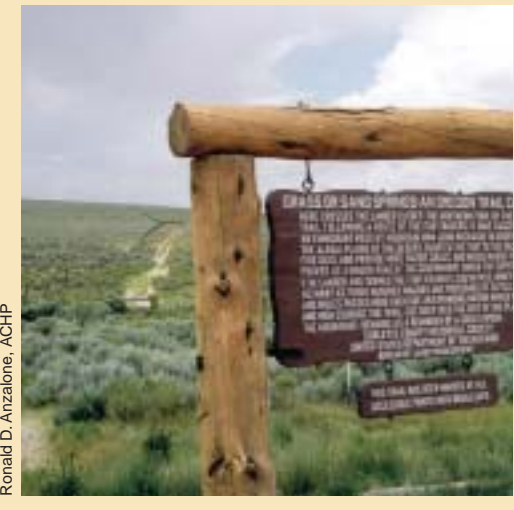
Travelers in Wyoming can see portions of the Oregon Trail, including parts of the Lander Cutoff, that are managed and interpreted by the Bureau of Land Management.