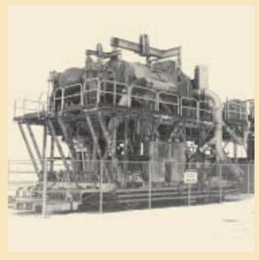
The Department of Energy's Experimental Breeder Reactor, a National Historic Landmark at the Idaho National Engineering and Experimental Laboratory in Scoville, ID, was the world's first nuclear reactor to produce usable amounts of electricity in 1951.

Preservation does not necessarily mean freezing places in time or restoring them as showpieces. Actually, the National Historic Preservation Act encourages active use of historic properties to meet the needs of the agency and of the public. Although maintaining historic properties in perpetuity is favored by the law, it's understood that this is not always feasible, so other forms of preservation—for example through study and documentation—are often acceptable. We decide how best to preserve historic places in consultation with concerned citizens, State and Tribal Historic Preservation Officers, local governments, tribes, Native Hawaiian organizations, Alaska Native groups, and others.