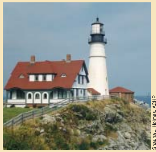
The U. S. Coast Guard transferred ownership of the 1791 Portland Head Light to the town of Cape Elizabeth, ME, while retaining access to the light and fog signal, both active aids to navigation.

Some preservation-related laws such as the Native American Graves Protection and Repatriation Act, the Archaeological Resources Protection Act, the American Indian Religious Freedom Act, and the National Environmental Policy Act—outline Federal agency responsibilities for additional kinds of cultural resources, such as ancestral American Indian and Native Hawaiian graves and cultural items, archeological artifact collections, traditional religious places and practices, and broad cultural values. Your Federal Preservation Officer can help make sure your agency complies wisely with these laws, as well as with the National Historic Preservation Act.