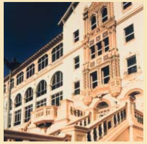
The Department of Veterans Affairs renovated its historic Bay Pines Medical Center, built in 1932 in St. Petersburg, FL, for use as an outpatient facility.