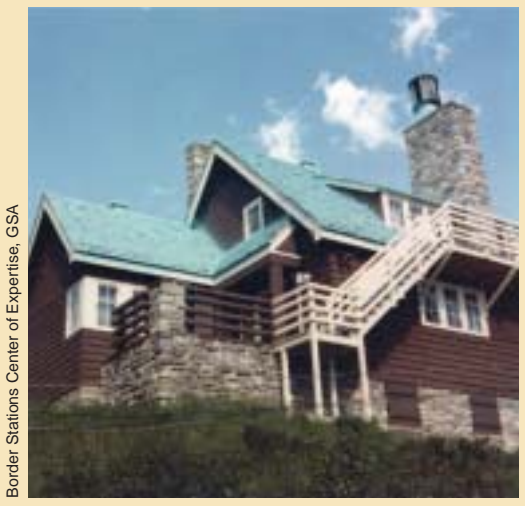
Chief Mountain Border Station (1938) in Babb, MT, is preserved by its continued use on the Canadian border by the Immigration and Naturalization Service and the U.S. Customs Service.

The National Park Service maintains a National Register of Historic Places that includes properties nominated through State, Federal or Tribal preservation officers. Federal agencies are responsible for thoughtfully managing resources both included in and also eligible for the National Register.