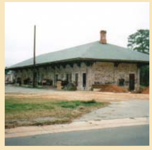
The Department of Transportation is providing TEA-21 transportation enhancement funds to help rehabilitate the Milledgeville, GA, railroad depot, originally constructed in 1854, for use by Georgia College and State University.

And finally, the challenge of taking advantage of opportunities for creative programs and projects that achieve both historic preservation and agency missions. For example, we need to look for opportunities for partnerships that preserve historic resources at little or no cost to the government.