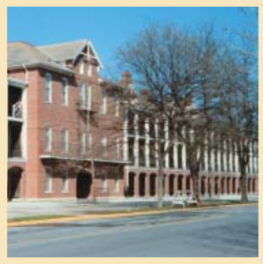
At Fort Leavenworth, KS, the Department of the Army turned an 1882 barracks located in the National Historic Landmark district into the National Simulation Center for simulation training, development, and conferences.