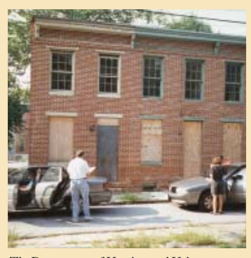
The Department of Housing and Urban Development provides financial assistance to non-profit sponsors through its 811 program to rehabilitate properties like these rowhouses in Union Square Historic District, West Baltimore, MD, for use as group homes for persons with disabilities.

At right: The Naval Air Weapons Station, China Lake, CA, is steward of this spectacular pictorial record of prehistoric life in the Coso Rock Art District, a National Historic Landmark.