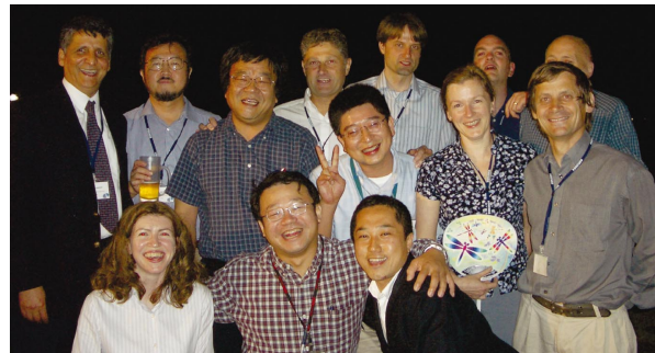
Colleagues from the UK and Japan on the occasion of the announcement that the UK would be hosting the 9th International BSR Conference in 2007.

The 8th International Conference on Biology and Synchrotron Radiation took place in Himeji, Japan, during the week of 7–11 September 2004. The meeting attracted some 300 delegates, with nearly half of them involved in crystallographic studies. All other major techniques including XAFS, SAXS, microscopy and circular dichroism were well represented. The conference was organized into ten mini-symposia with some 50 oral presentations and 160 posters. There were four special lectures, three on crystallographic studies (one each on membrane proteins, time-resolved crystallography and the calcium pump) and one on medical imaging/therapy. Johann Deisenhoffer, who shared the Nobel Prize with Robert Huber and Hartmut Michel in 1988 for the first structure of a membrane protein [ Nature (London) , (1985), 318 , 618–624], suggested that the rate of progress in the structure determination of membrane proteins is increasing exponentially in a manner similar to that of the soluble protein [see White (2004), Protein Sci. 13 , 1948–1949]. By 2025, over 2000 structures of membrane proteins should be determined.