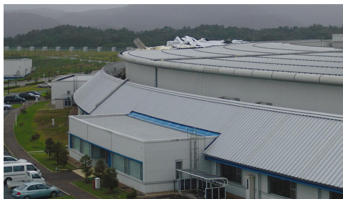
The damaged roof of SPring-8.

The year 2004 has seen many typhoons in Japan. On 7 September, the welcoming reception date for the BSR2004 conference, a severe typhoon, number 18, hit the Kansai area. The Shinkansen network stopped south of Osaka and local trains stopped south of Kobe. This typhoon resulted in significant damage to the roof of SPring-8, which had shown some signs of minor damage from typhoon number 16 only a couple of weeks earlier. The roof repair is expected to take place early in 2005 and the start-up in 2005 is yet to be determined.