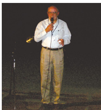
Johann Deisenhoffer thanking the organisers on behalf of the international community.

The meeting attracted participants from several countries, including Taiwan, China and Korea where synchrotron radiation activities are expanding rapidly. In addition to an excellent scientific and cultural experience, international delegates were exposed to a memorable experience of a typhoon (number 18) as they arrived in Japan (see below). On 10 September, the organisers arranged a ‘Japanese-style’ barbecue banquet at an exclusive golf club, ‘Tatsuno Classic’. On this occasion, Johann Deisenhoffer (pictured below) thanked the organisers on behalf of the international community for