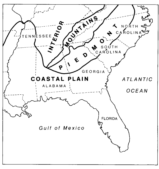
Figure. Major physiographic regions of the southeastern United States.