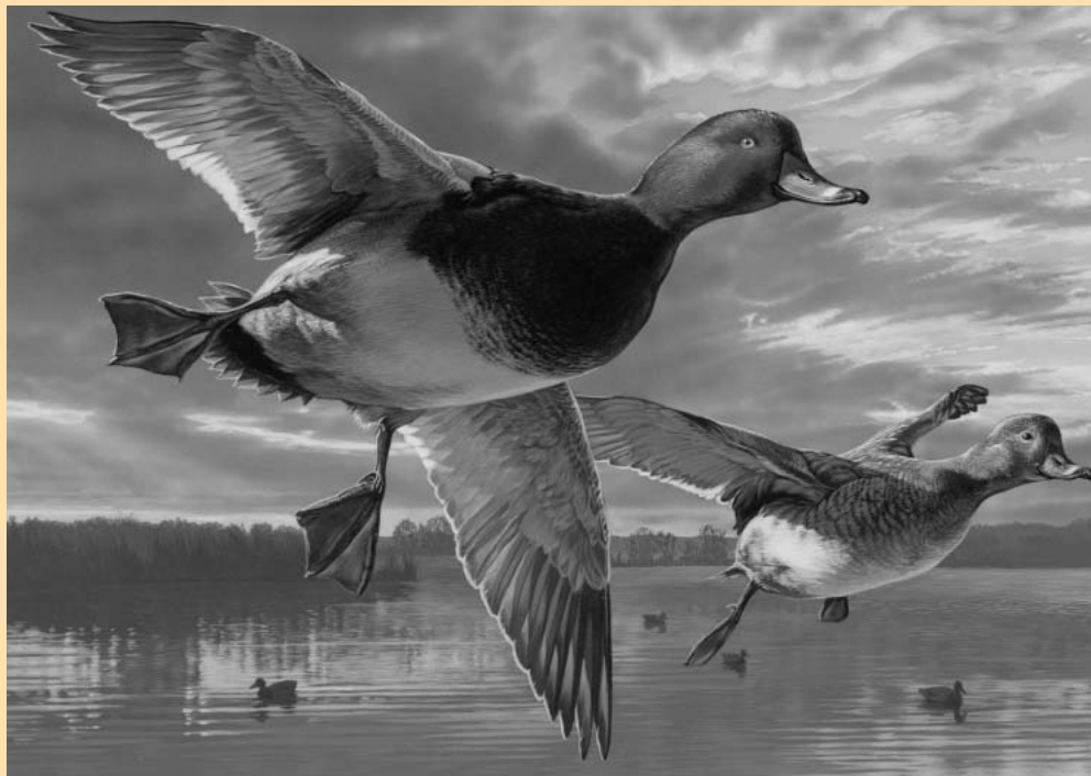
2003 Federal Duck Stamp Contest Winner

All entries must be date stamped no later than midnight August 16, 2004.